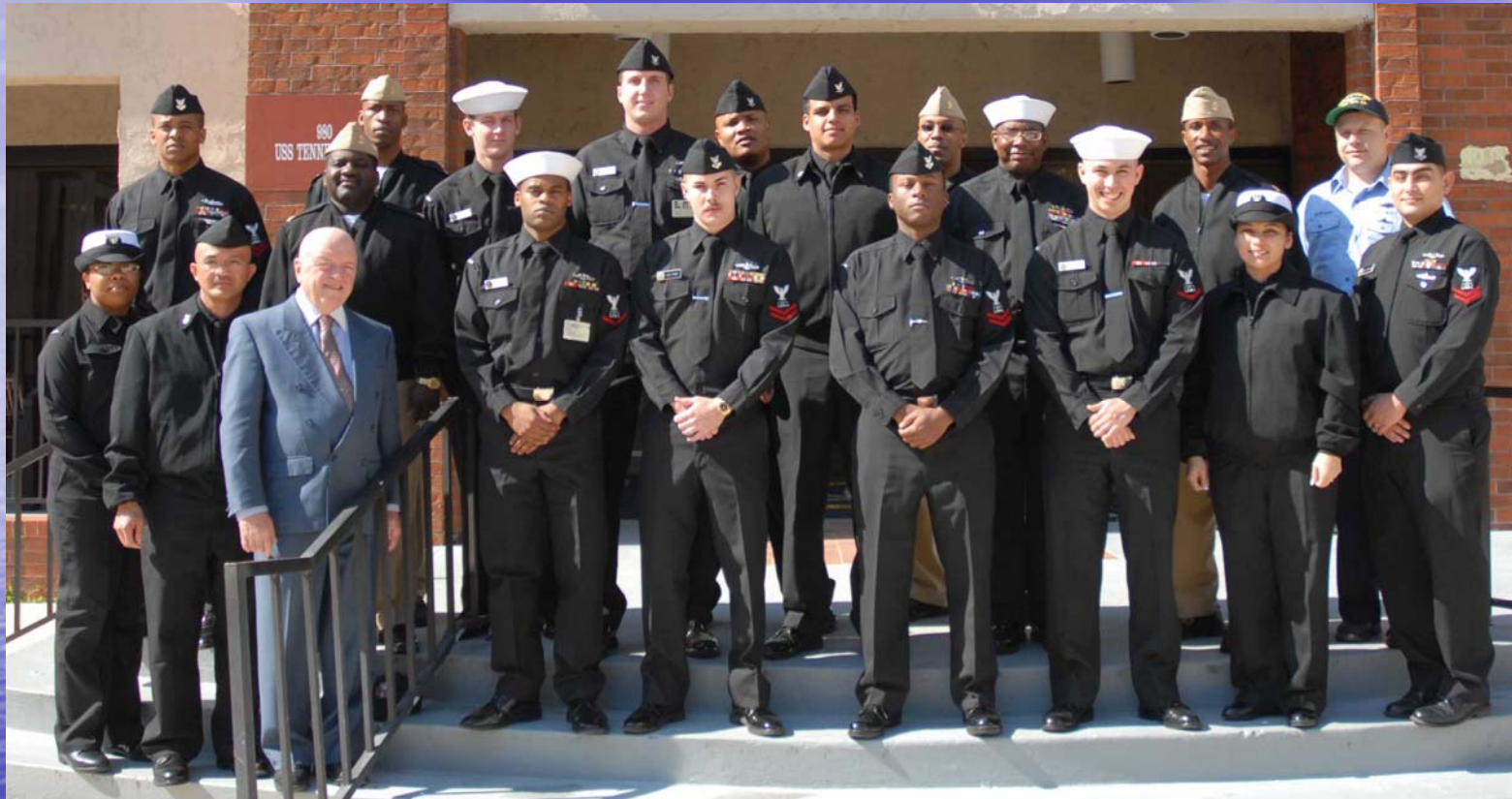
Naval Submarine Base Kings Bay, Georgia February 2008