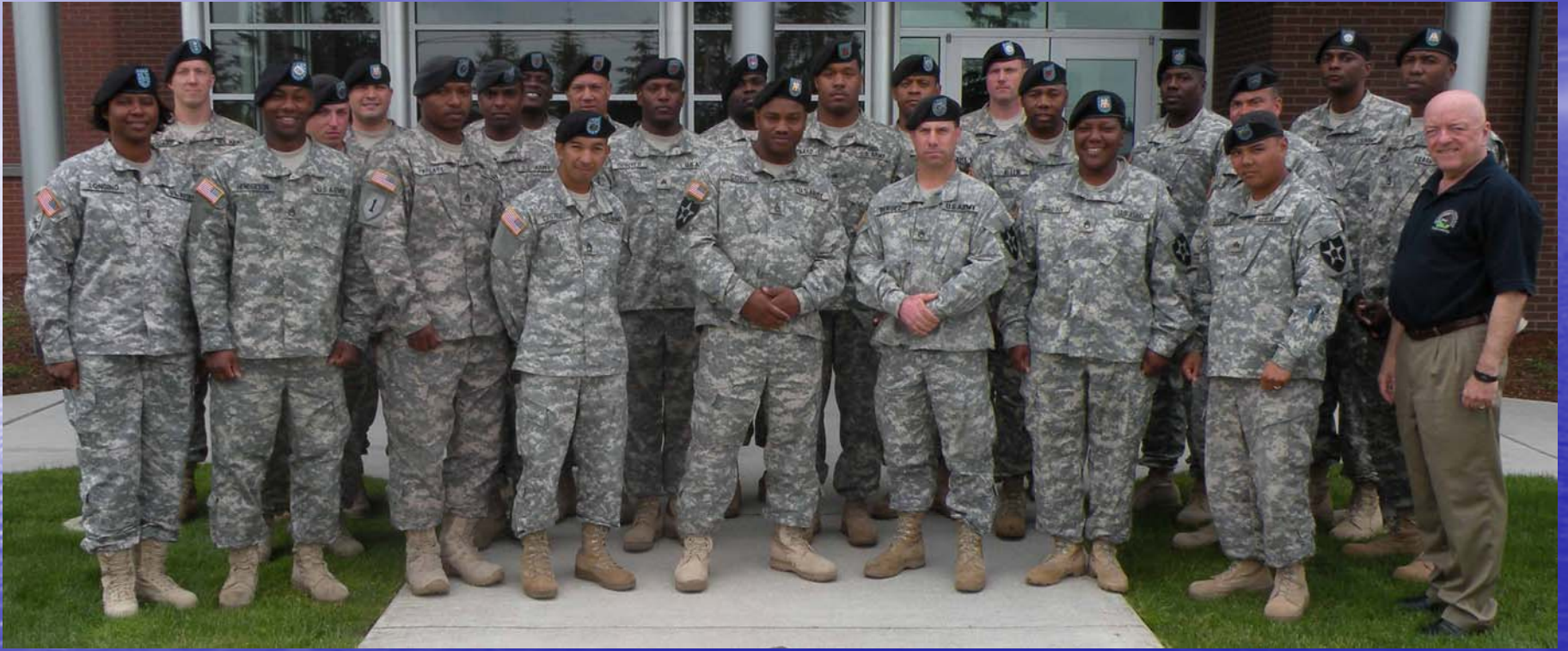
Fort Lewis, Washington June 2009