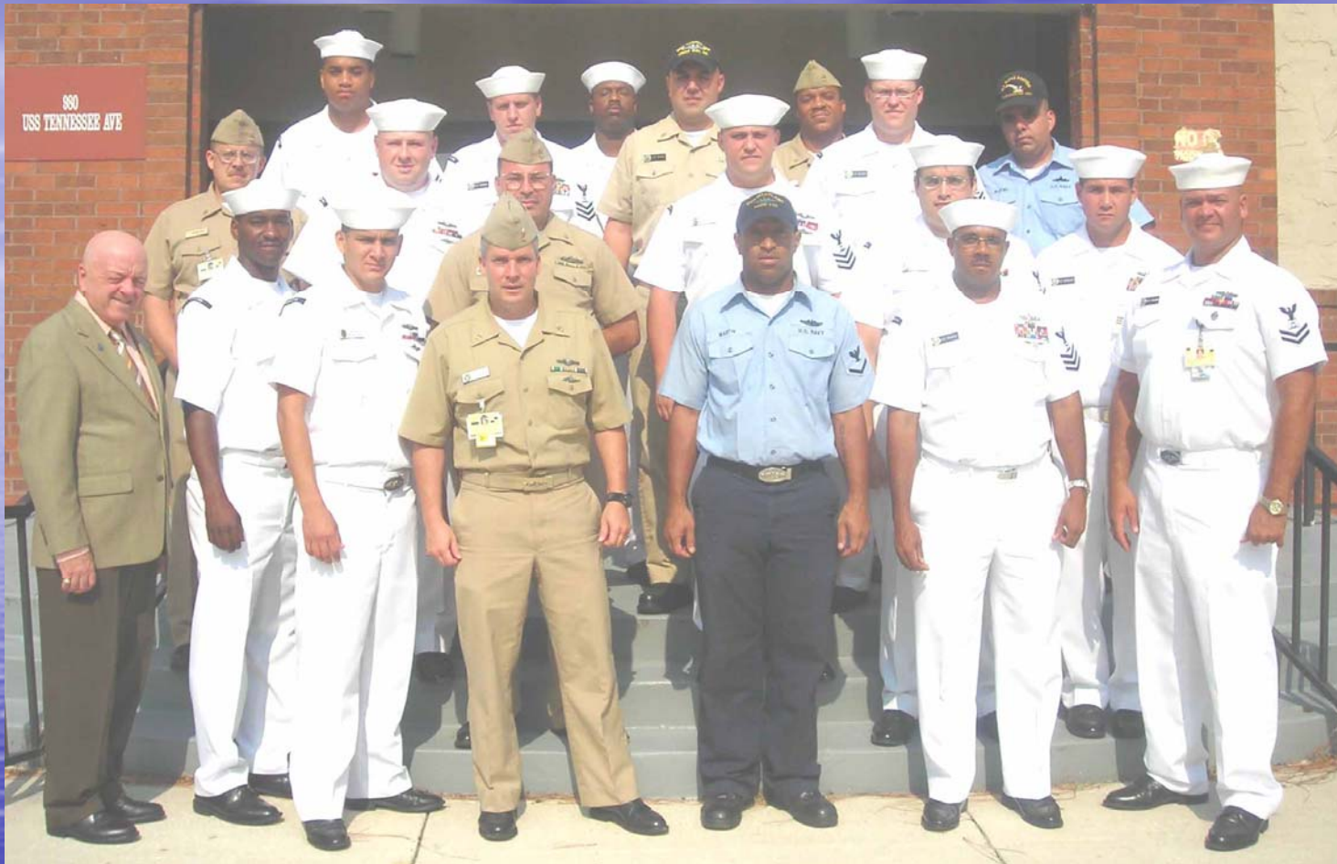
Naval Submarine Base Kings Bay, Georgia August 2007