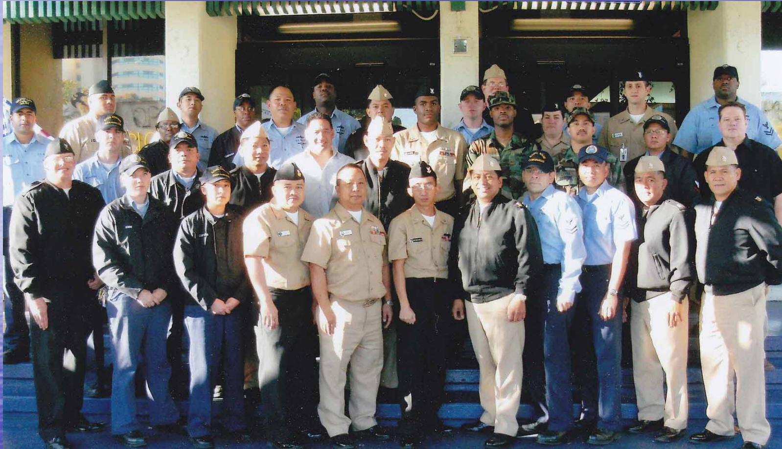
Naval Station, San Diego February 2009