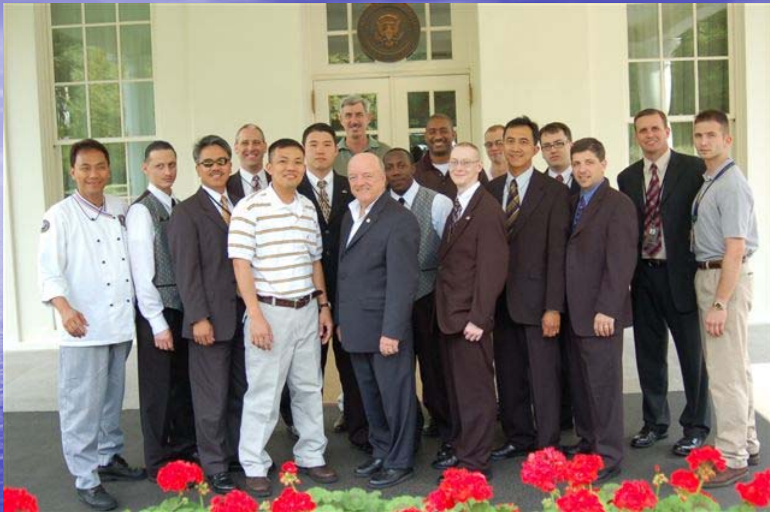
The White House June 2006