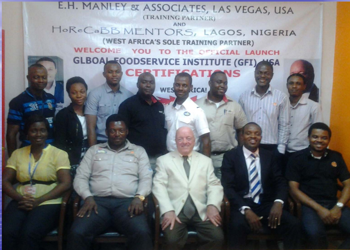
Port Harcourt, Nigeria, West Africa Sundry Foods Headquarters October 2013