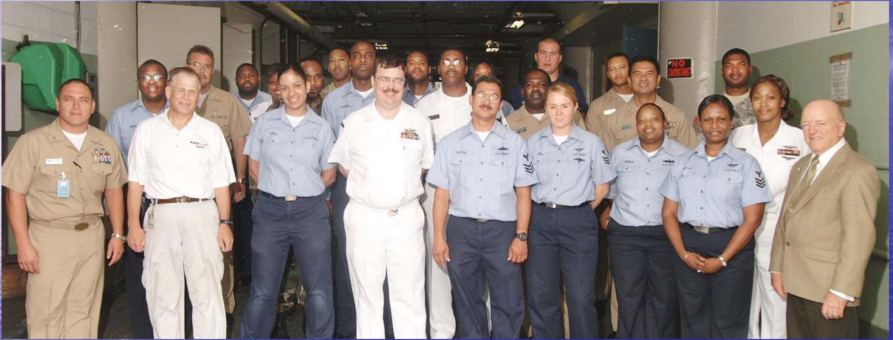
Navy Food Management Team Office Naval Base, Norfolk, Virginia August 2006