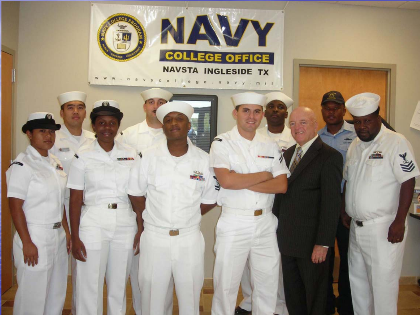
Navy Minesweeper Base, Ingleside, TX October 2008