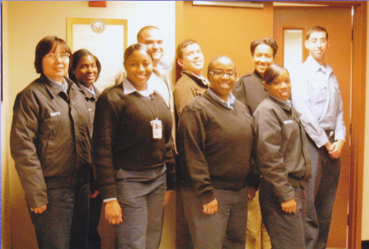
Navy Base, Norfolk, Virginia February 2009