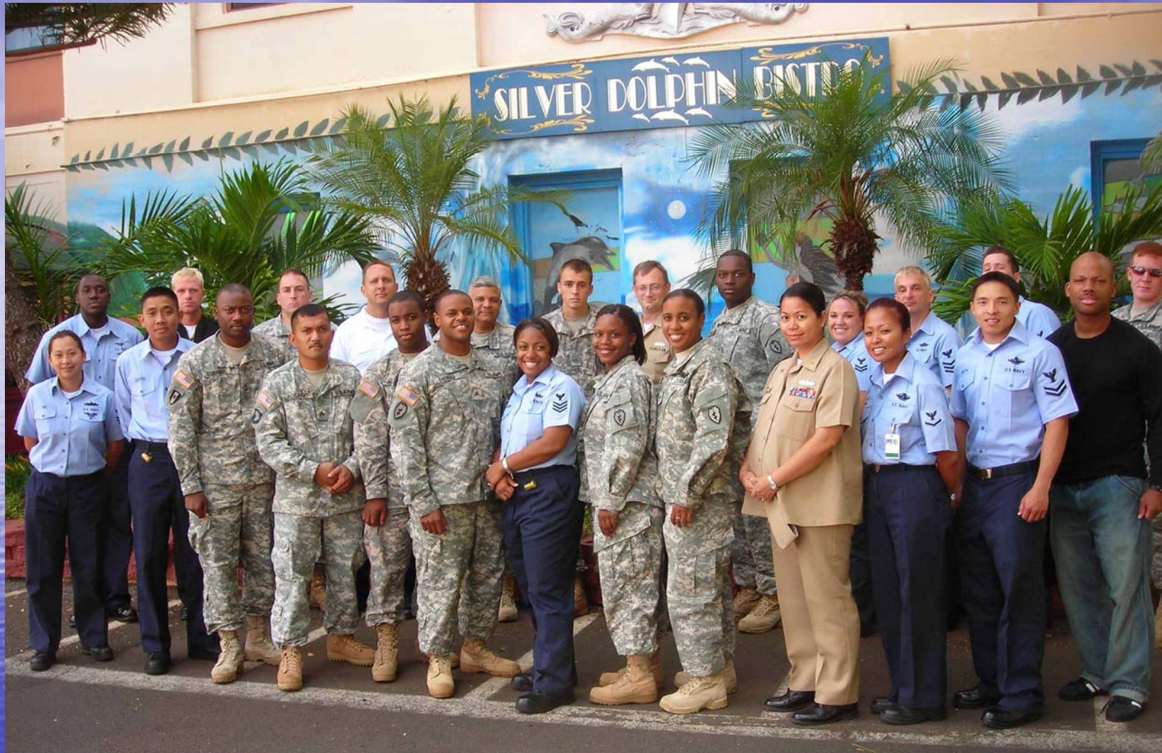
Naval Station, Pearl Harbor June 2009