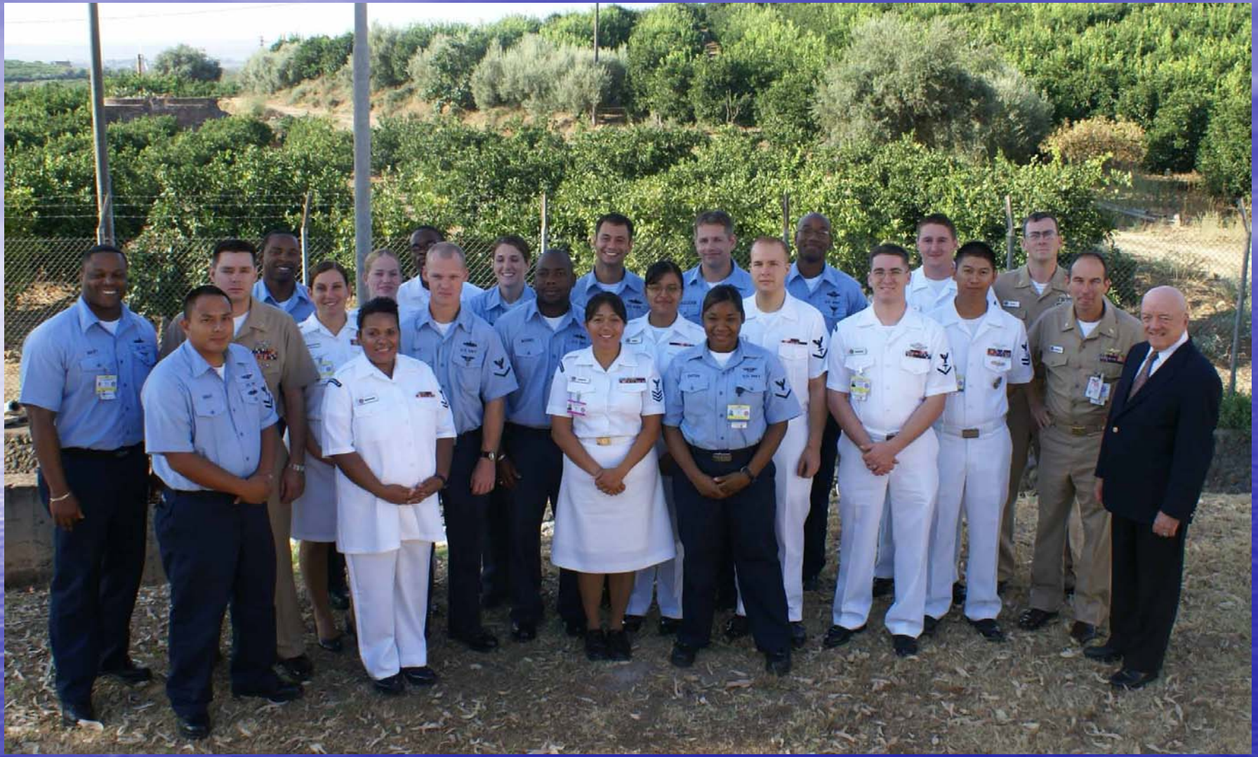
Naval Hospital, Sigonella, Sicily August 2009