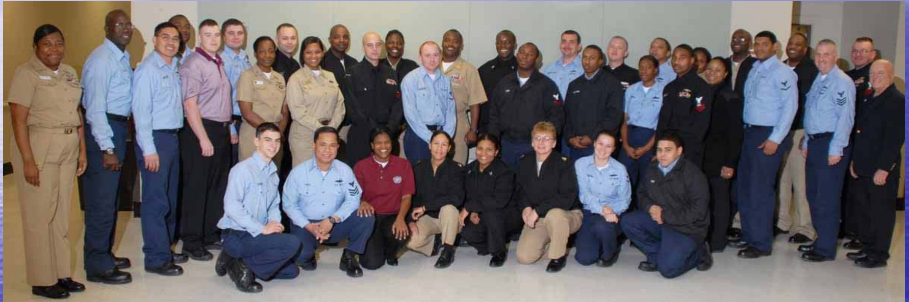
Navy Base, Norfolk, Virginia January 2009