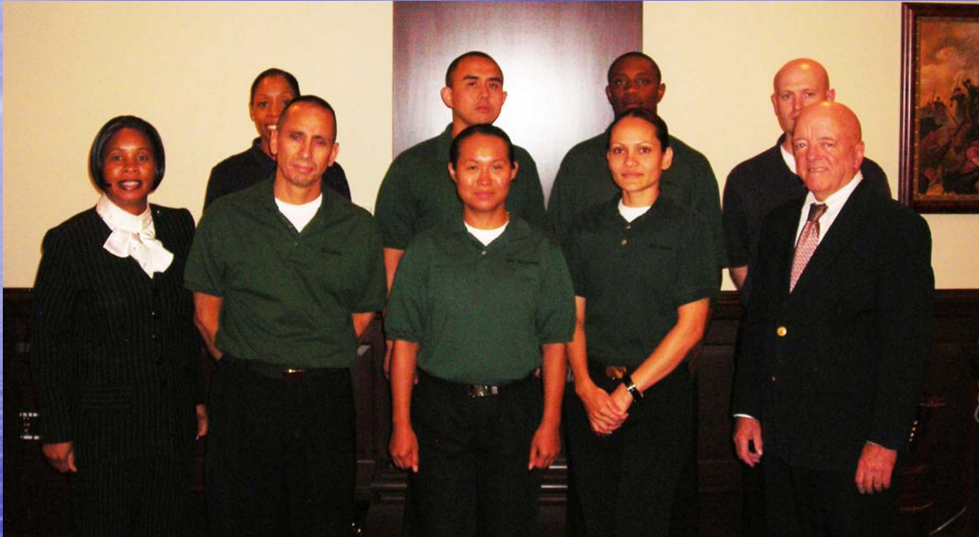
The Pentagon Secretary of the Army's Office June 2010