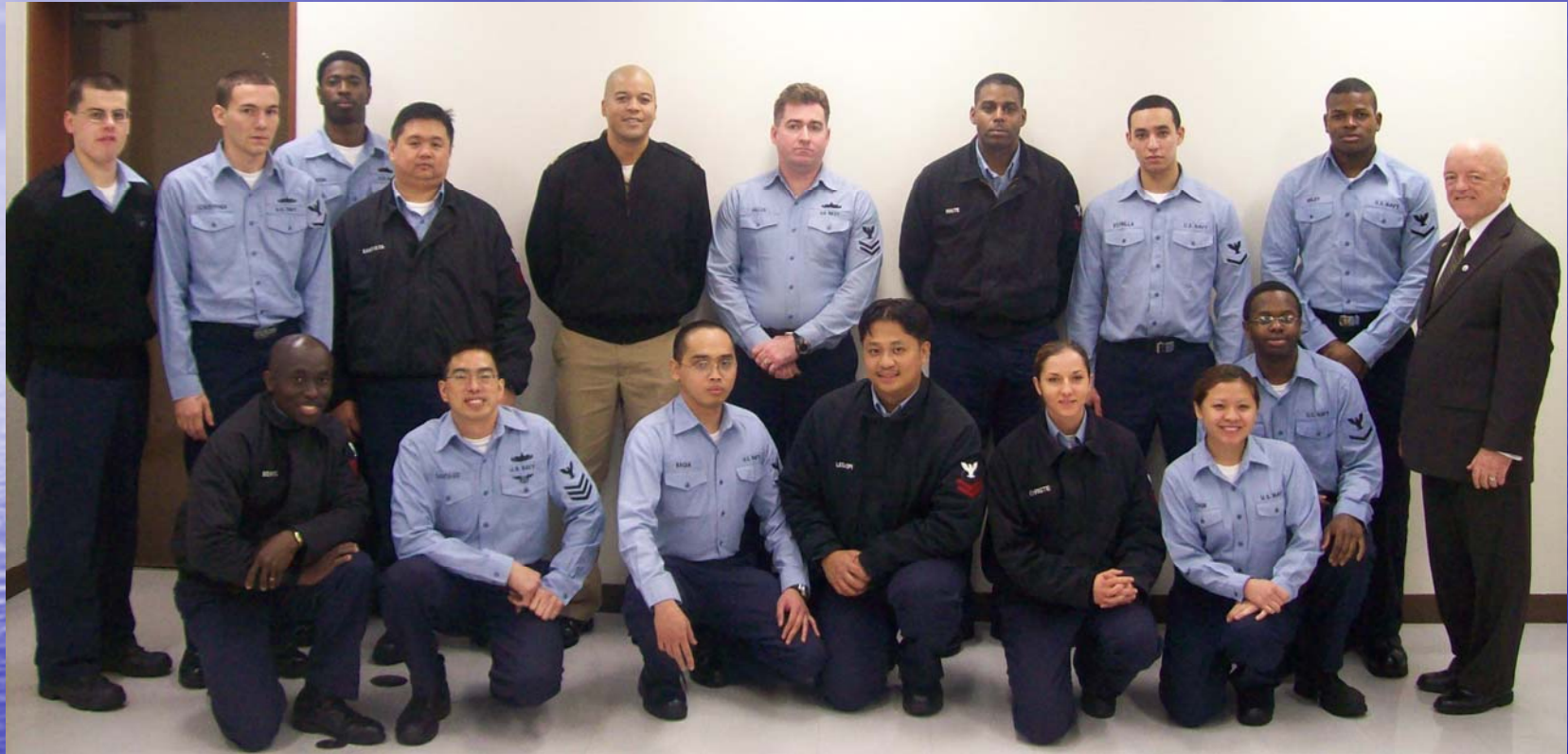
Yokosuka, Japan April 2008