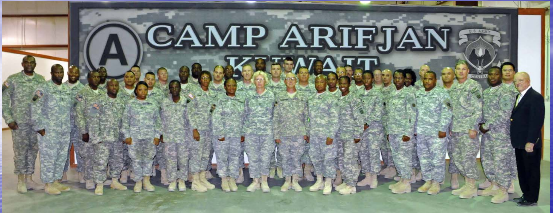
Camp Arifjan, Kuwait July 2009