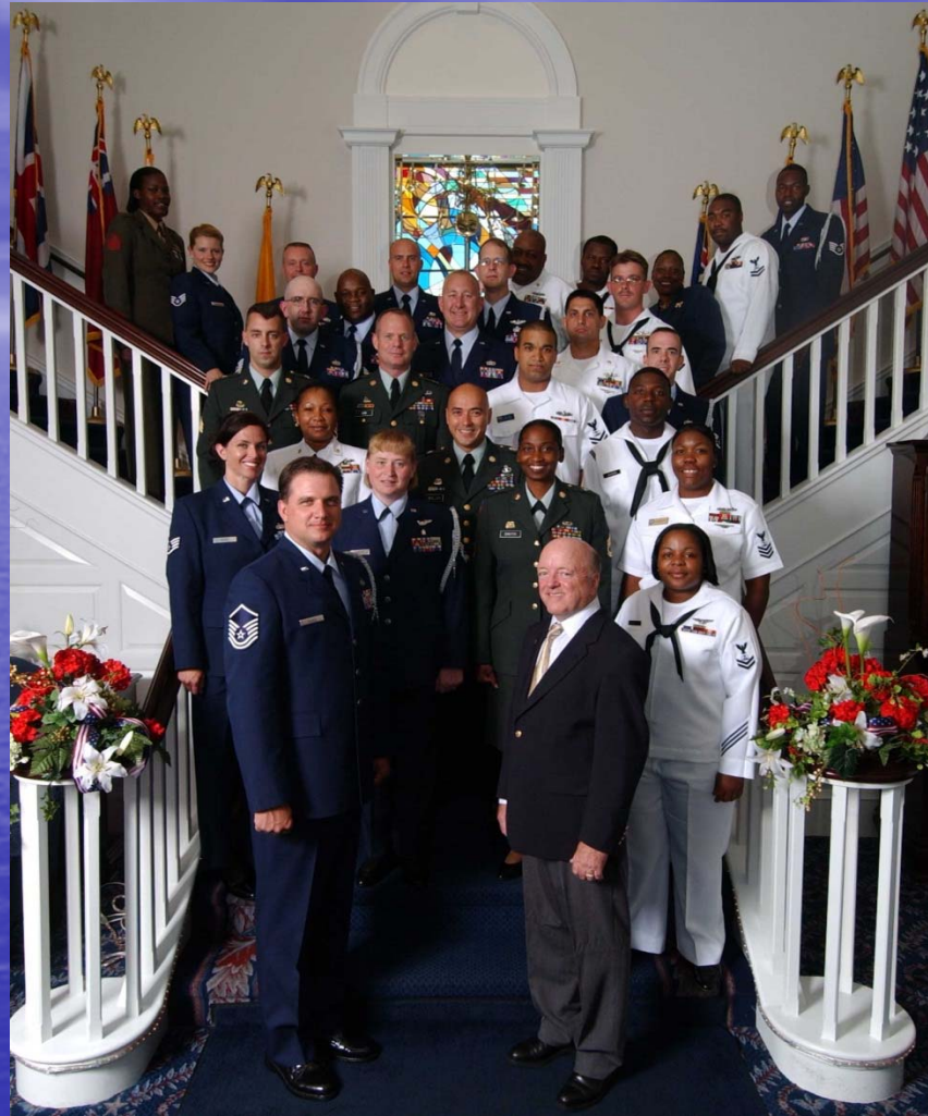
Bolling Air Force Base July 2005