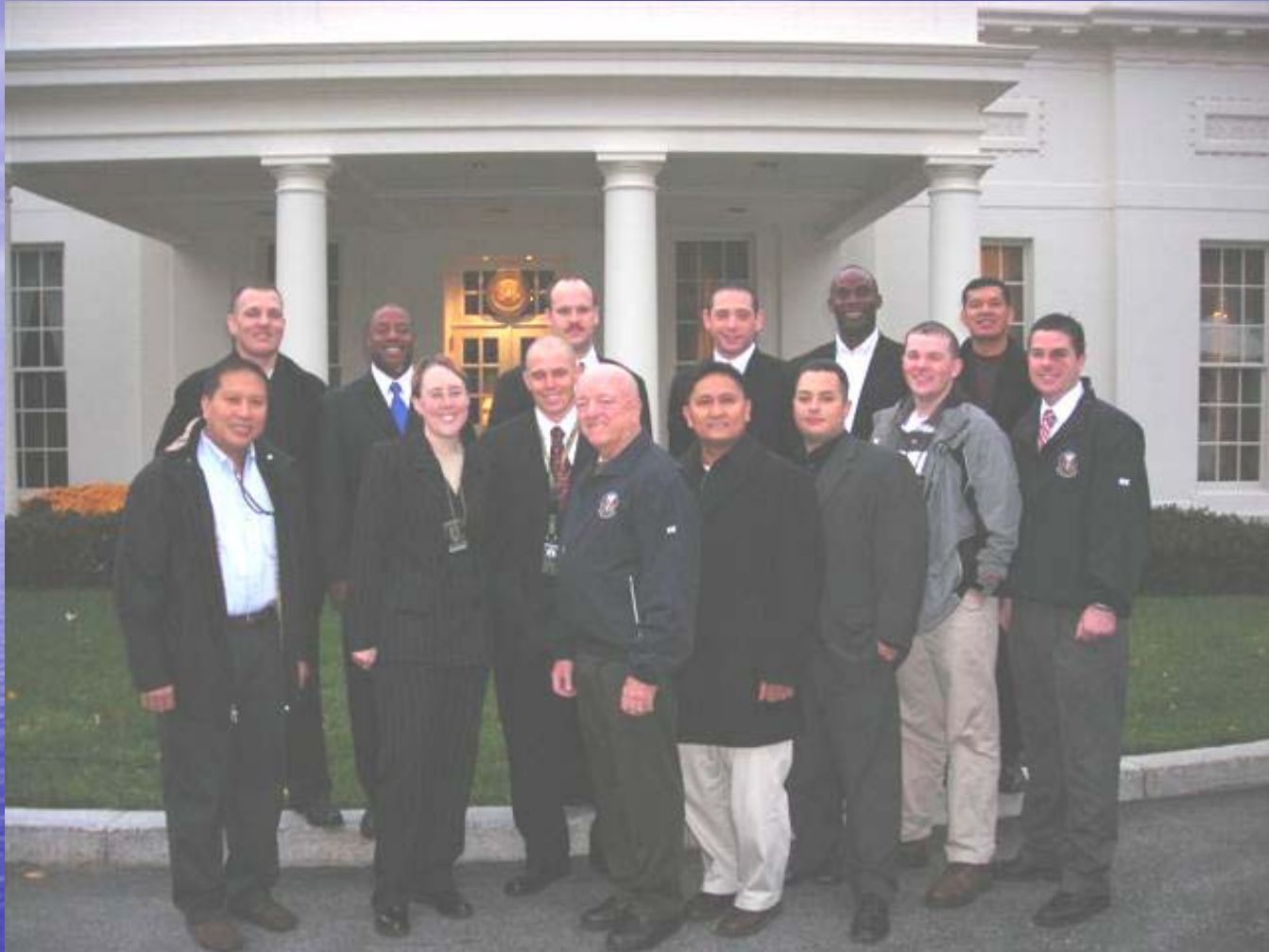
The White House November 2007