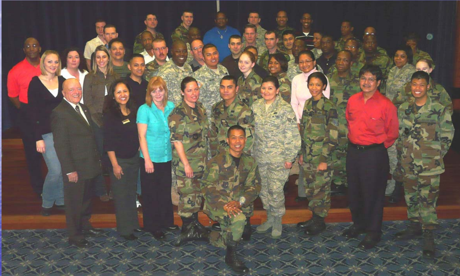
Spangdahlem AFB, Germany April 2008