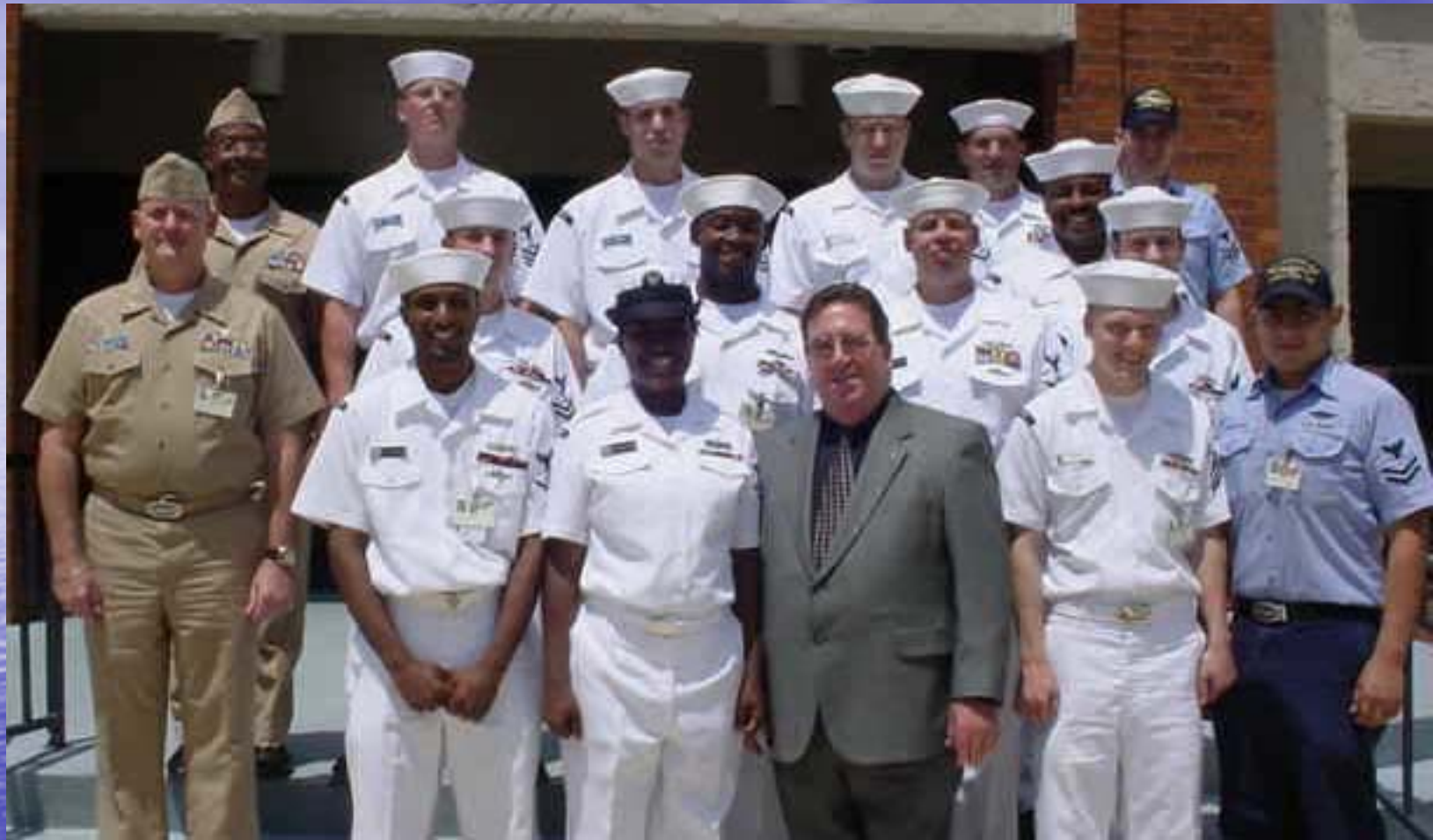
Naval Submarine Base Kings Bay, Georgia May 2008