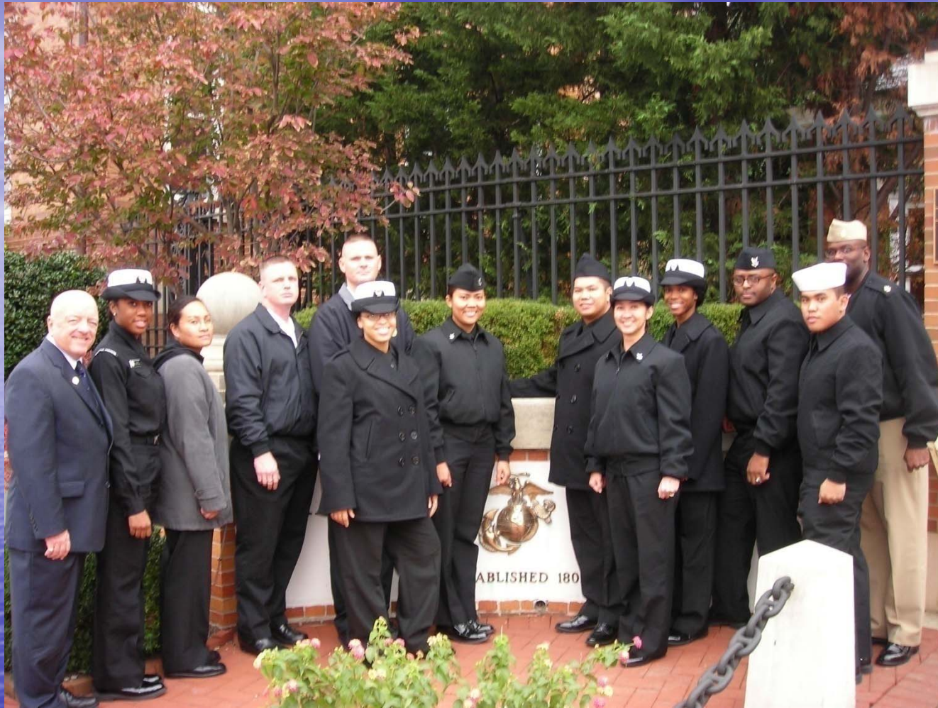
Marine Barracks 8 th and I November 2007