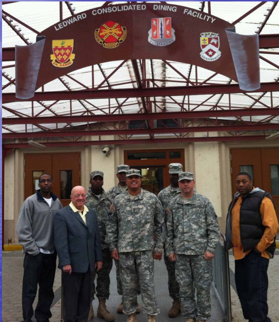
Schweinfurt, Germany October 2012