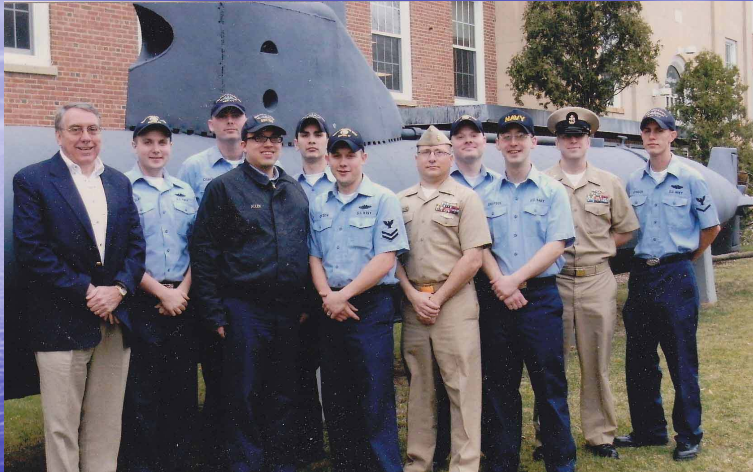
Submarine Base, Groton, CT March 2009