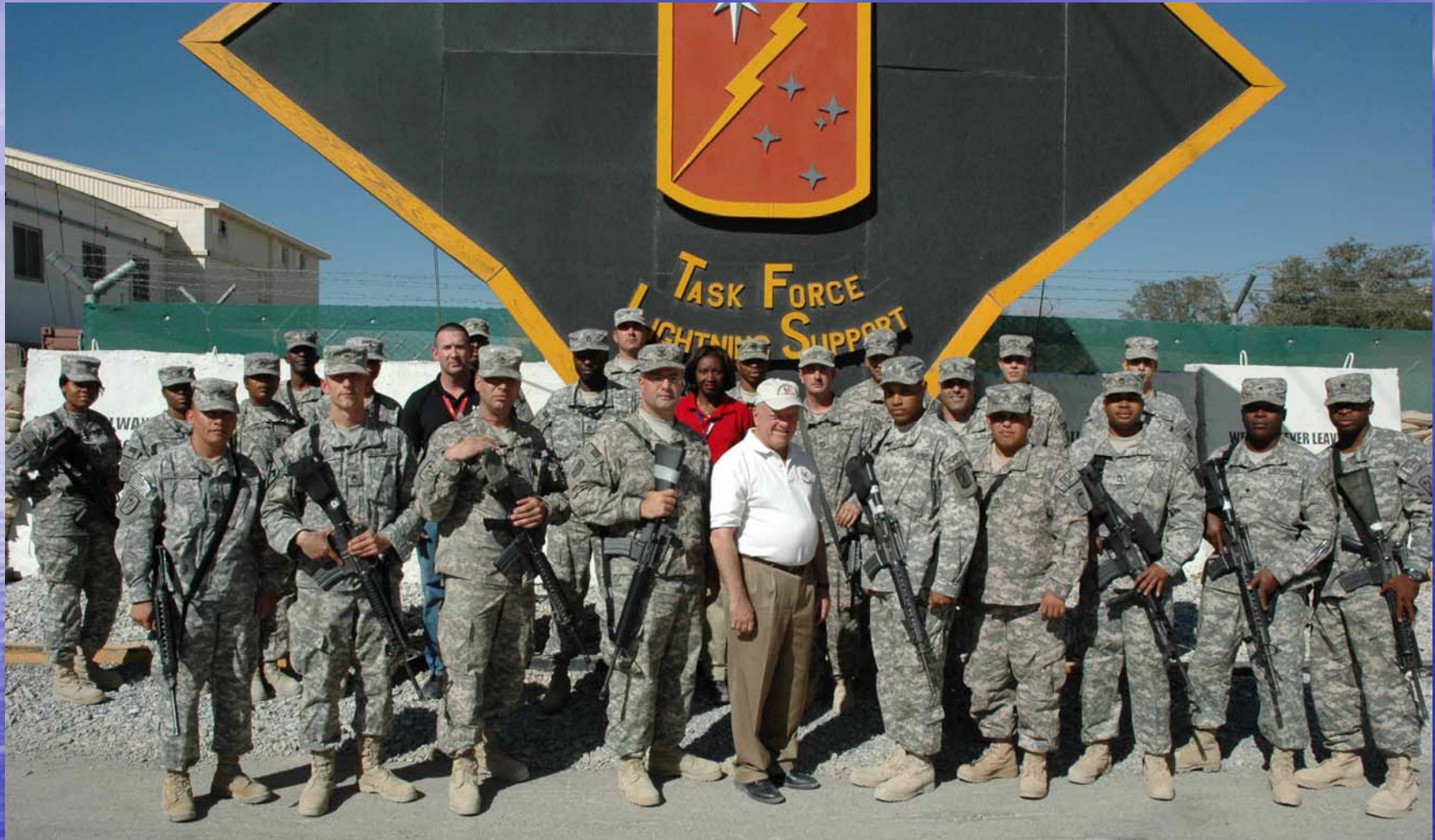
Bagram Air Base, Afghanistan September 2009