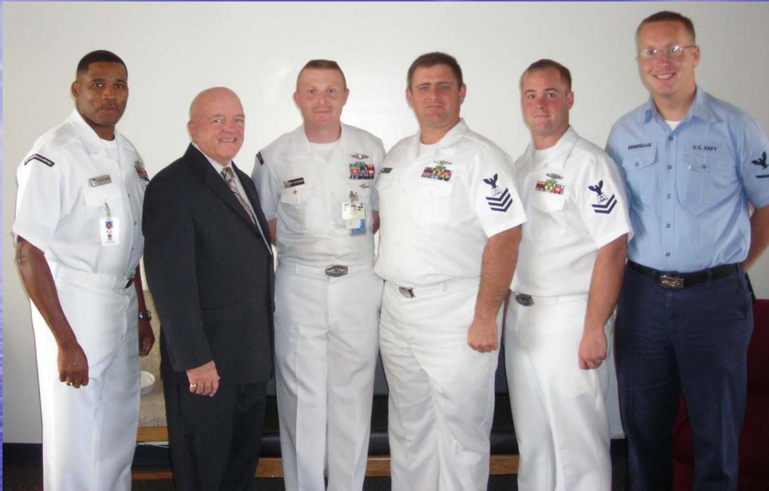
Mayport, Florida October 2008