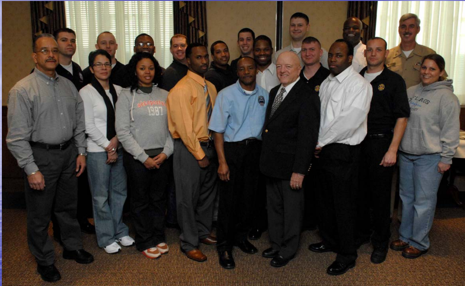
The Pentagon Secretary of the Navy's Office January 2008