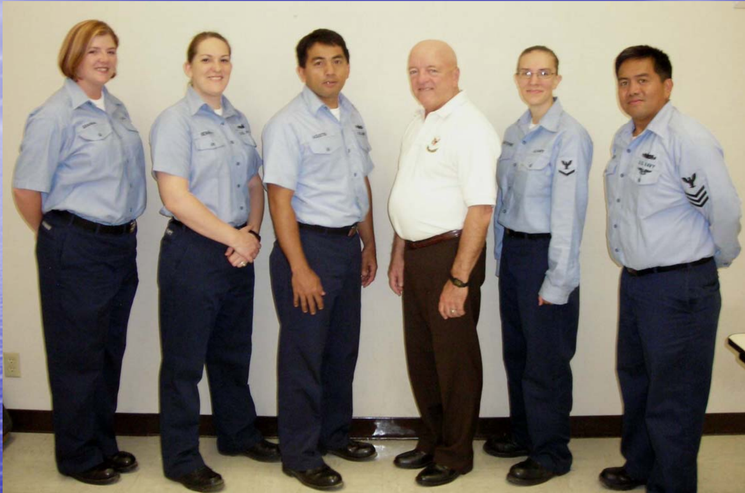
NAS North Island, San Diego September 2008