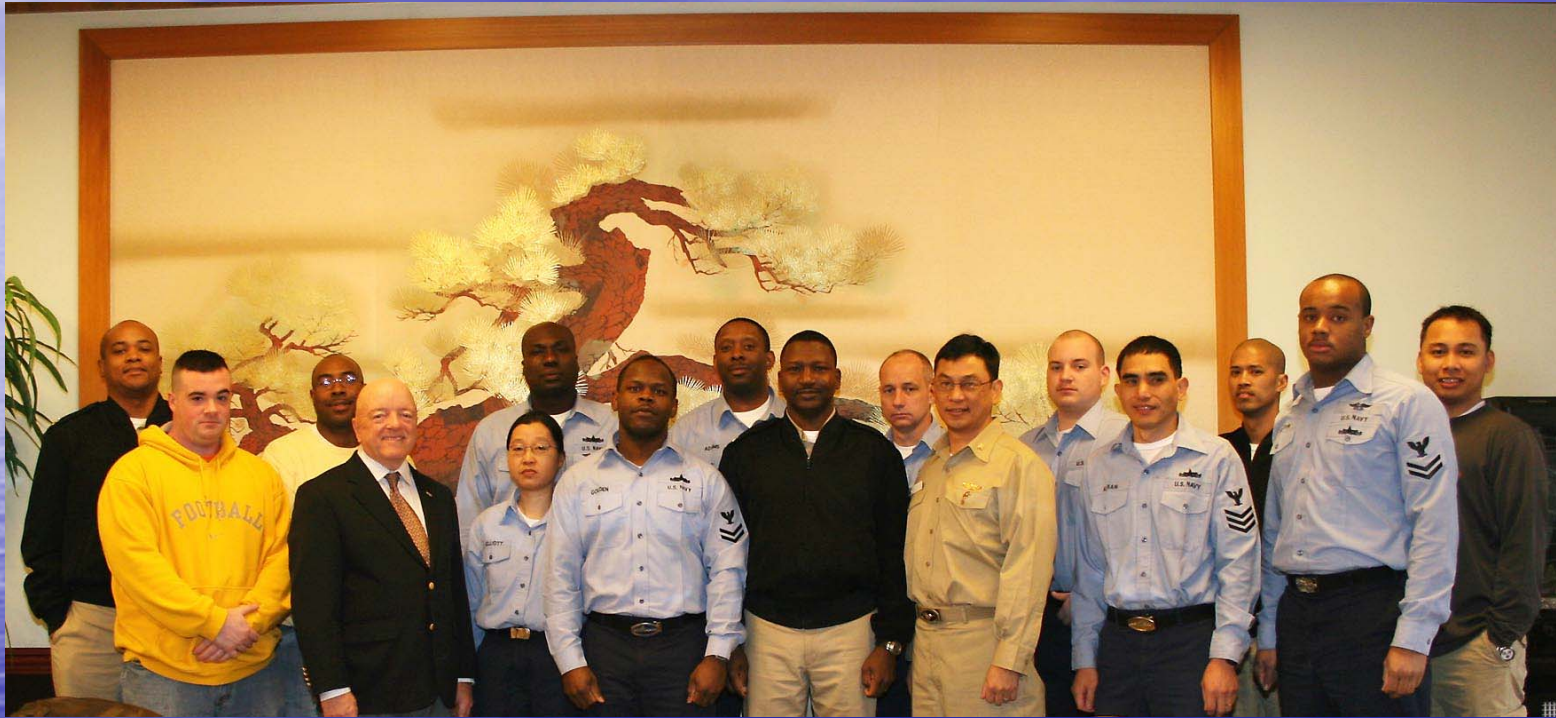
Yokosuka, Japan January 2008