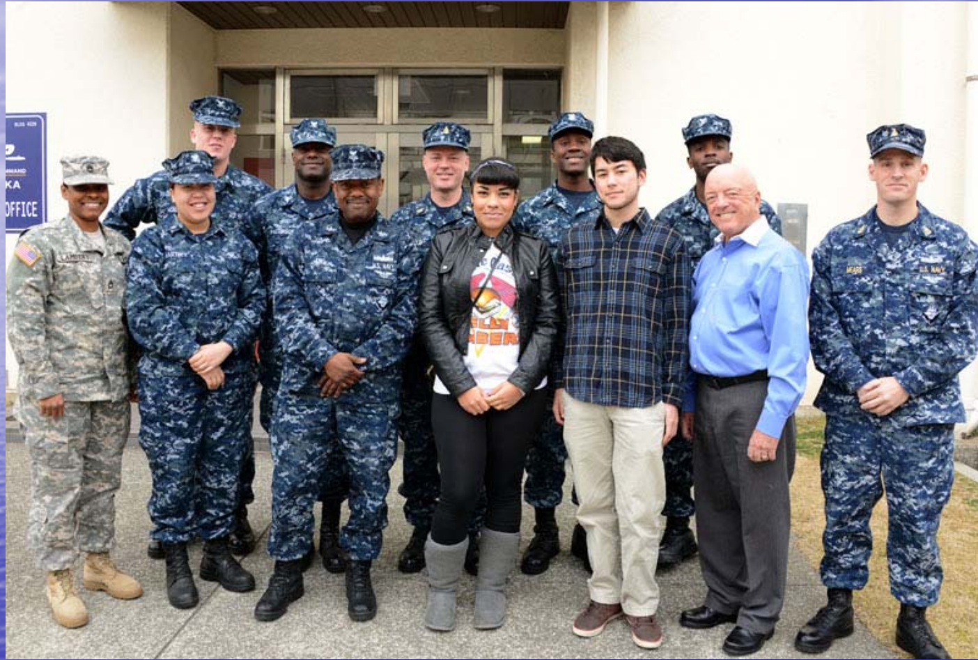
Yokosuka, Japan February 2013