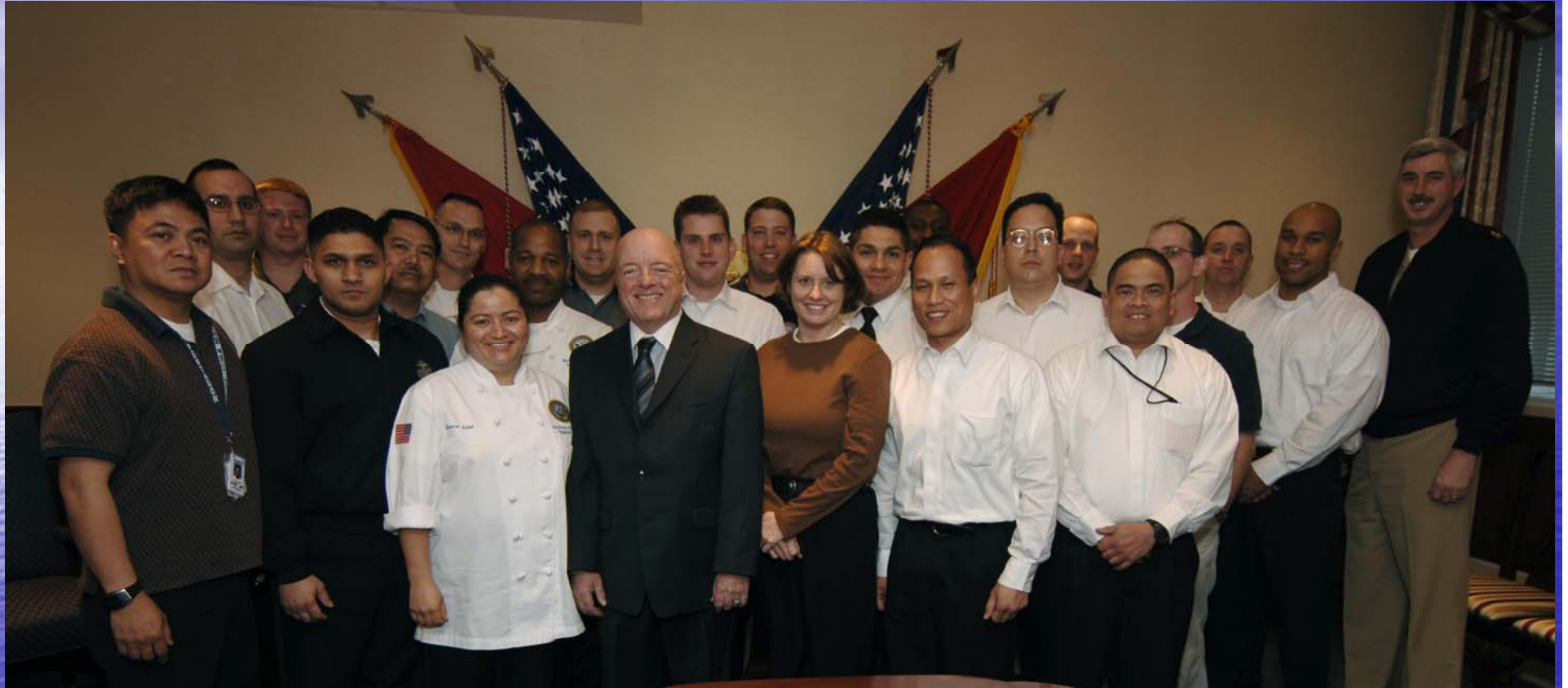
The Pentagon Secretary of the Navy's Office January 2007