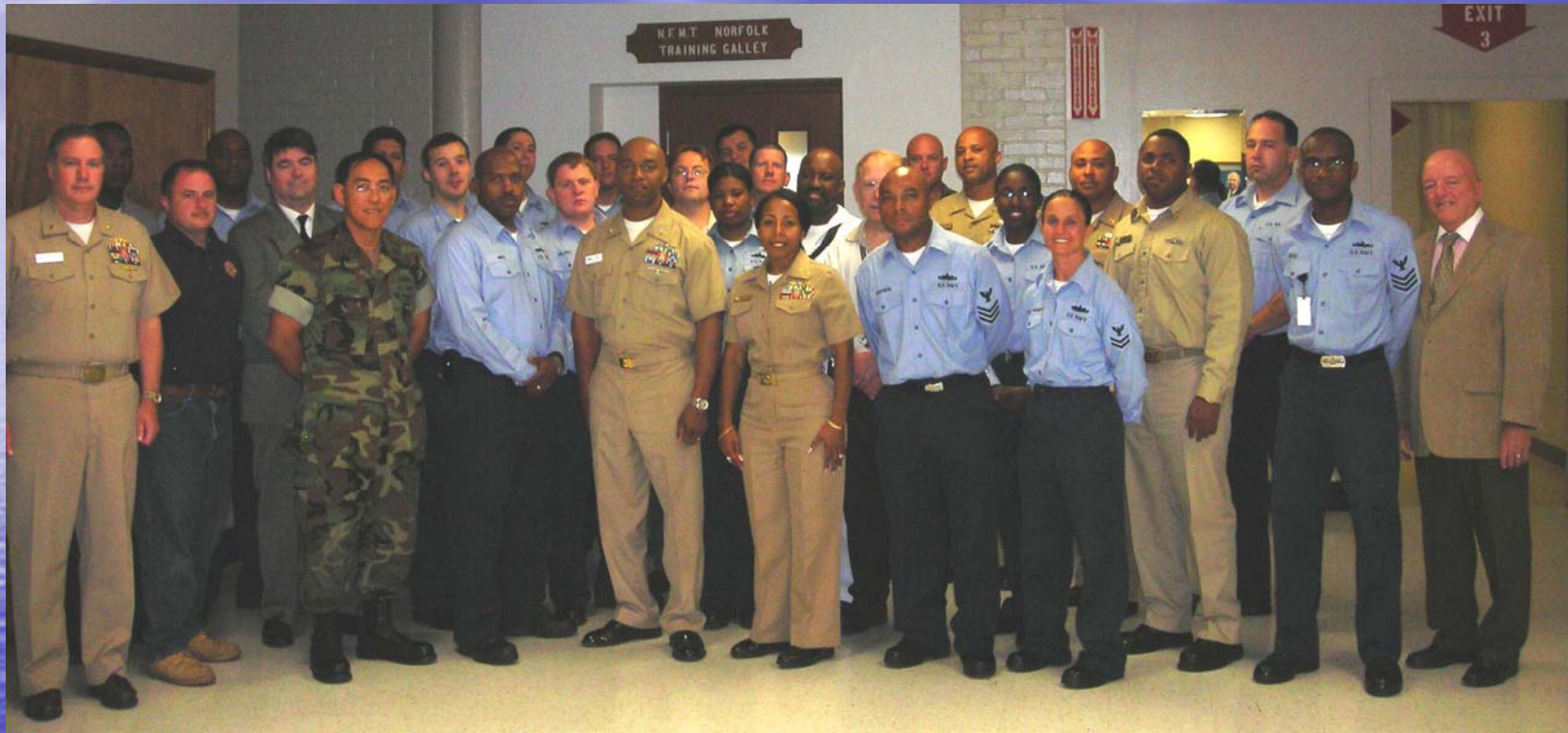
Navy Base, Norfolk, Virginia September 2008