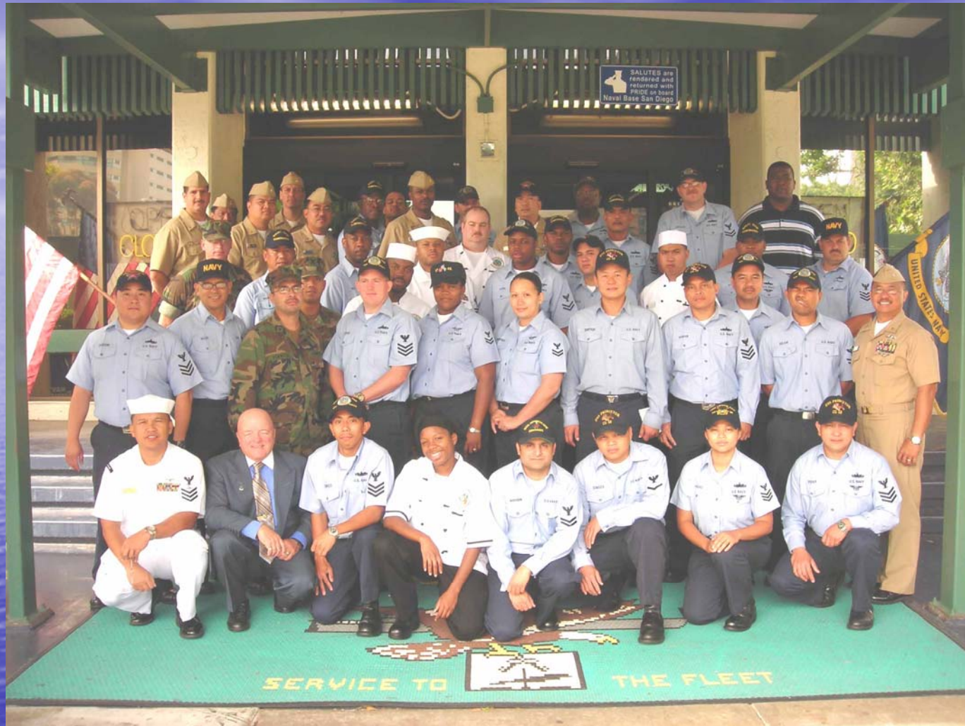
Naval Station 32 nd Street, San Diego June 2008