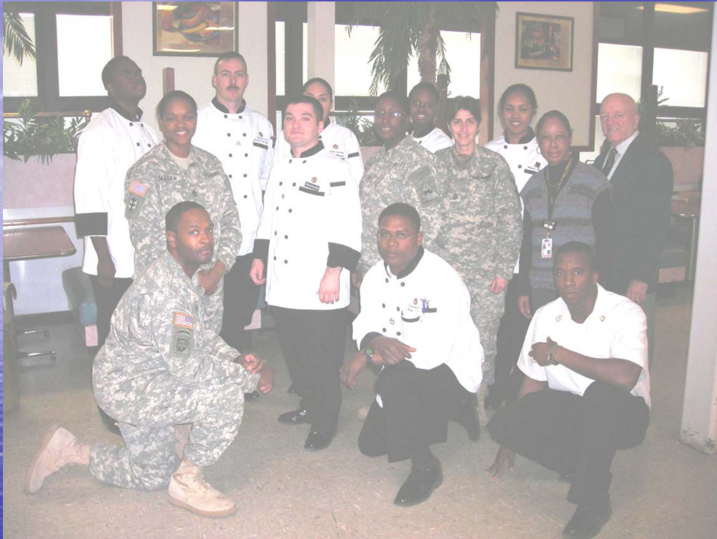
Fort Riley, Kansas February 2008