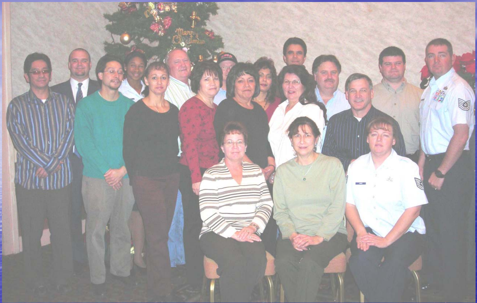
Albuquerque, New Mexico December 2007