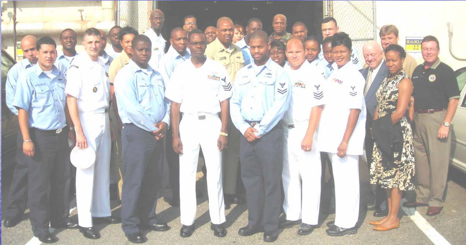
Navy Food Management Team Office Naval Base, Norfolk, Virginia August 2007