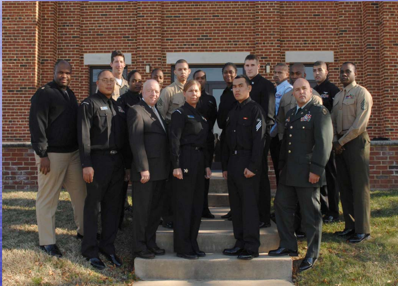
Bolling Air Force Base December 2006