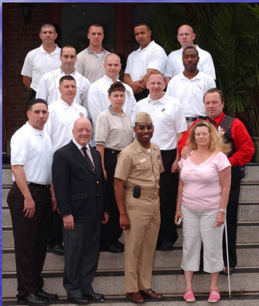
Marine Barracks 8 th and I May 2007