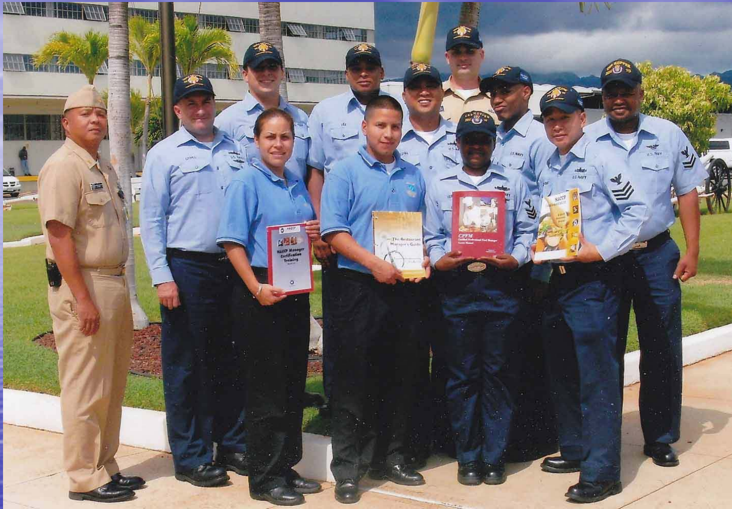
Naval Station, Pearl Harbor September 2008