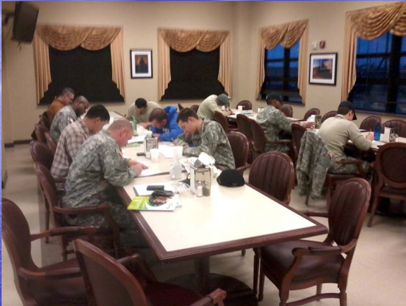
Fort Campbell January 2013