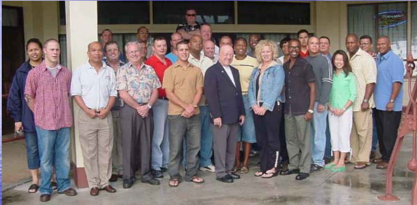
Hawaii – Coast Guard Station February 2006