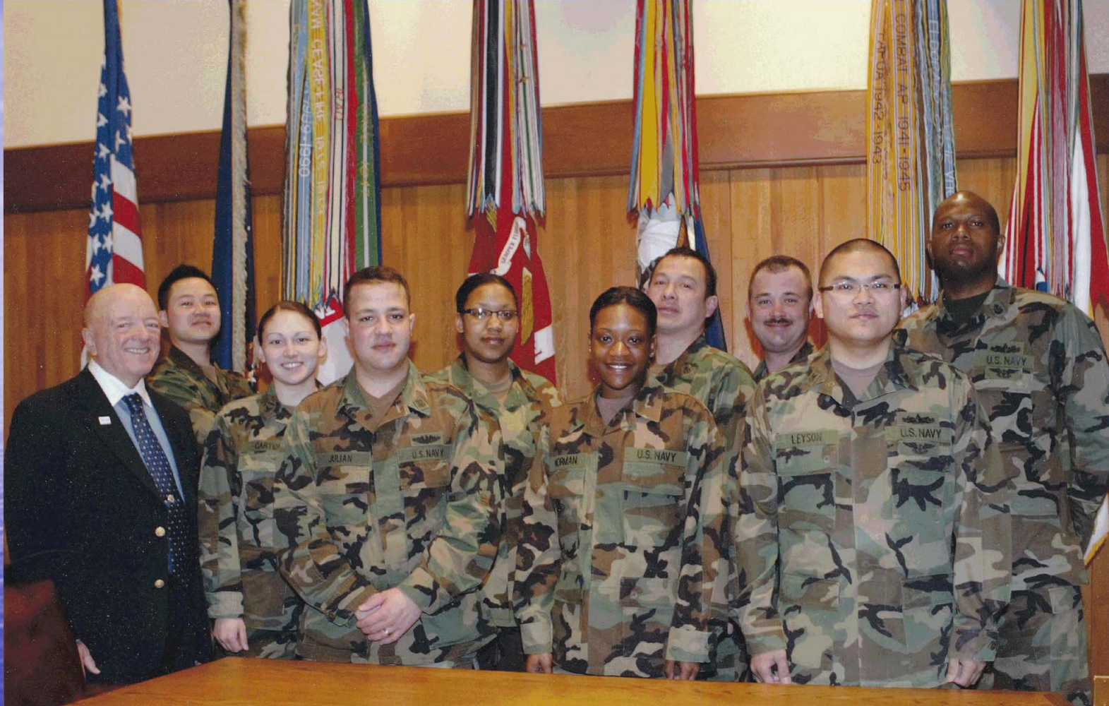
Presidential Retreat, Thurmont January 2008