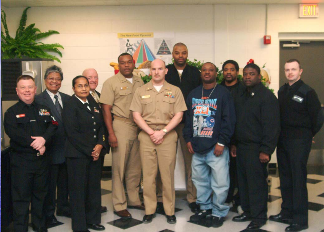
Great Lakes, Culinary Specialist "A" School February, 2007