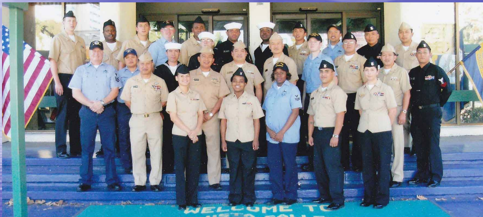
Naval Station, San Diego November 2008