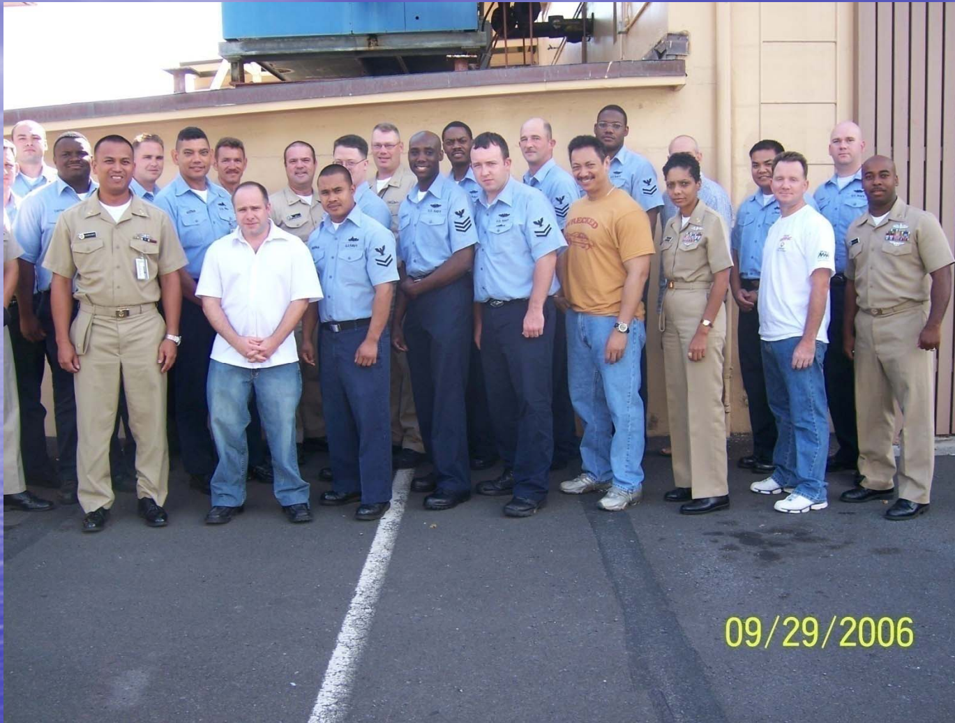
Submarine Force Pacific, Pearl Harbor September 2006