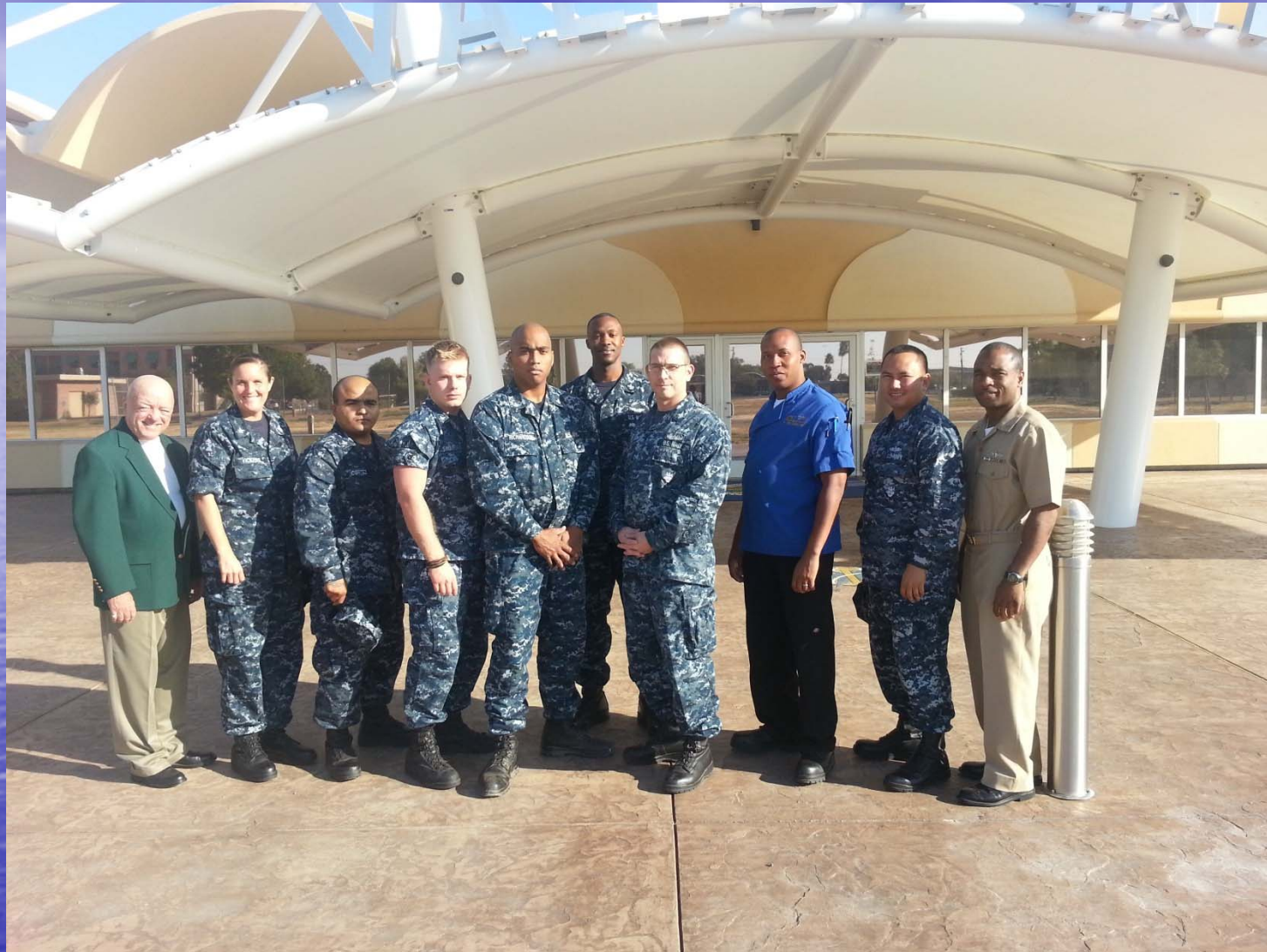
Naval Air Station, Lemoore, California August 2013