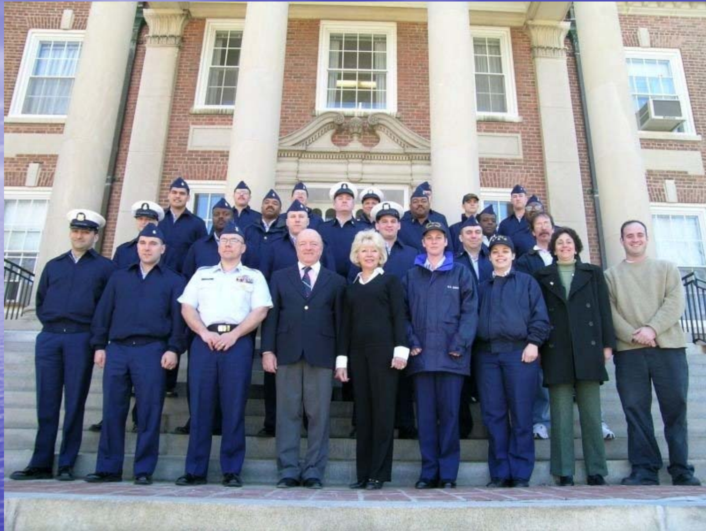
The Coast Guard Academy May 2006