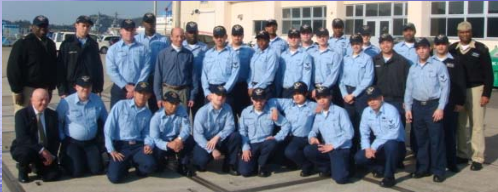
Yokosuka, Japan January 2009