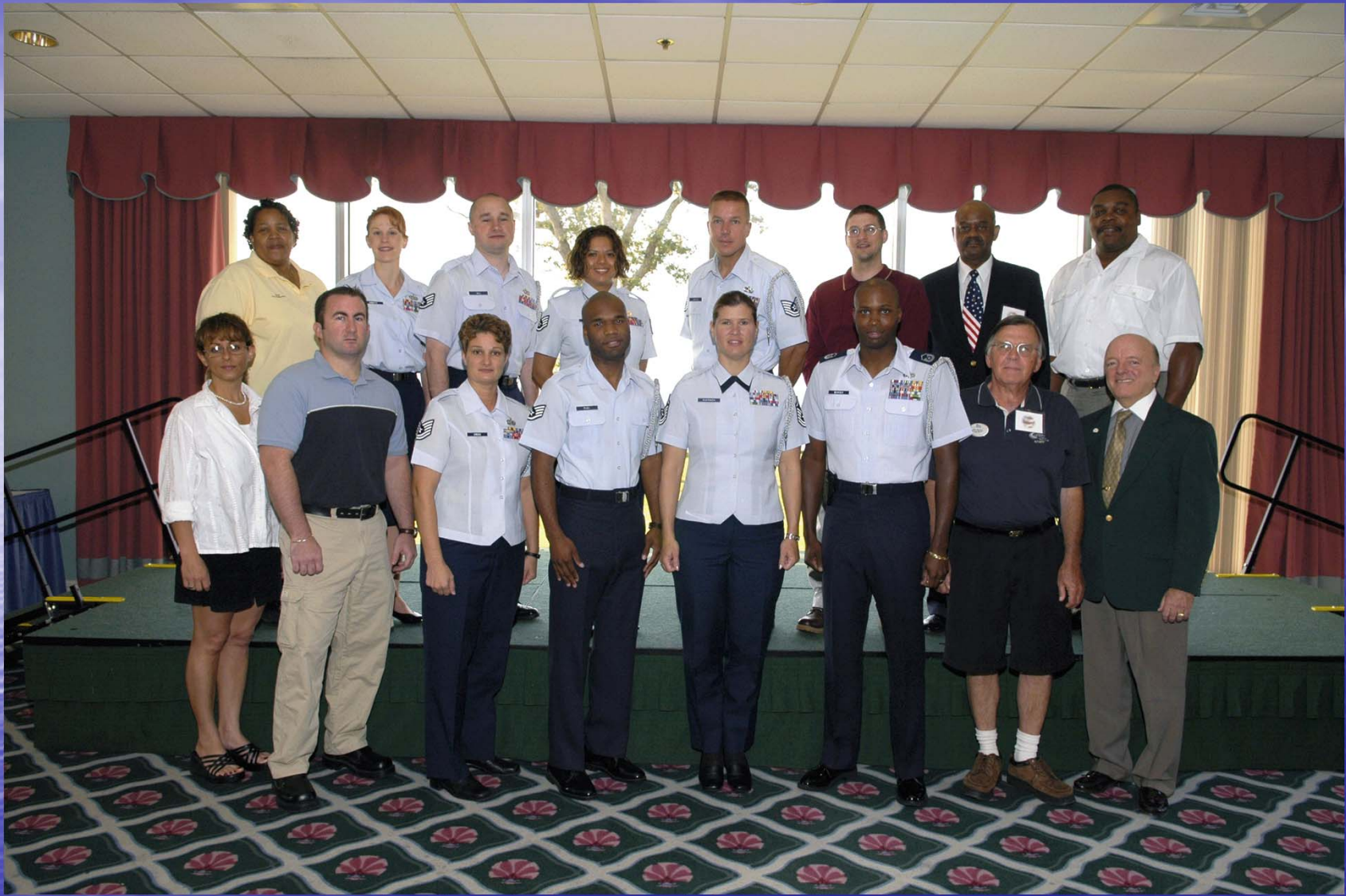
Eglin Air Force Base May 2005