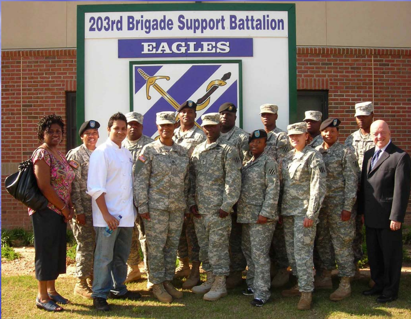
Fort Benning, GA June 2009