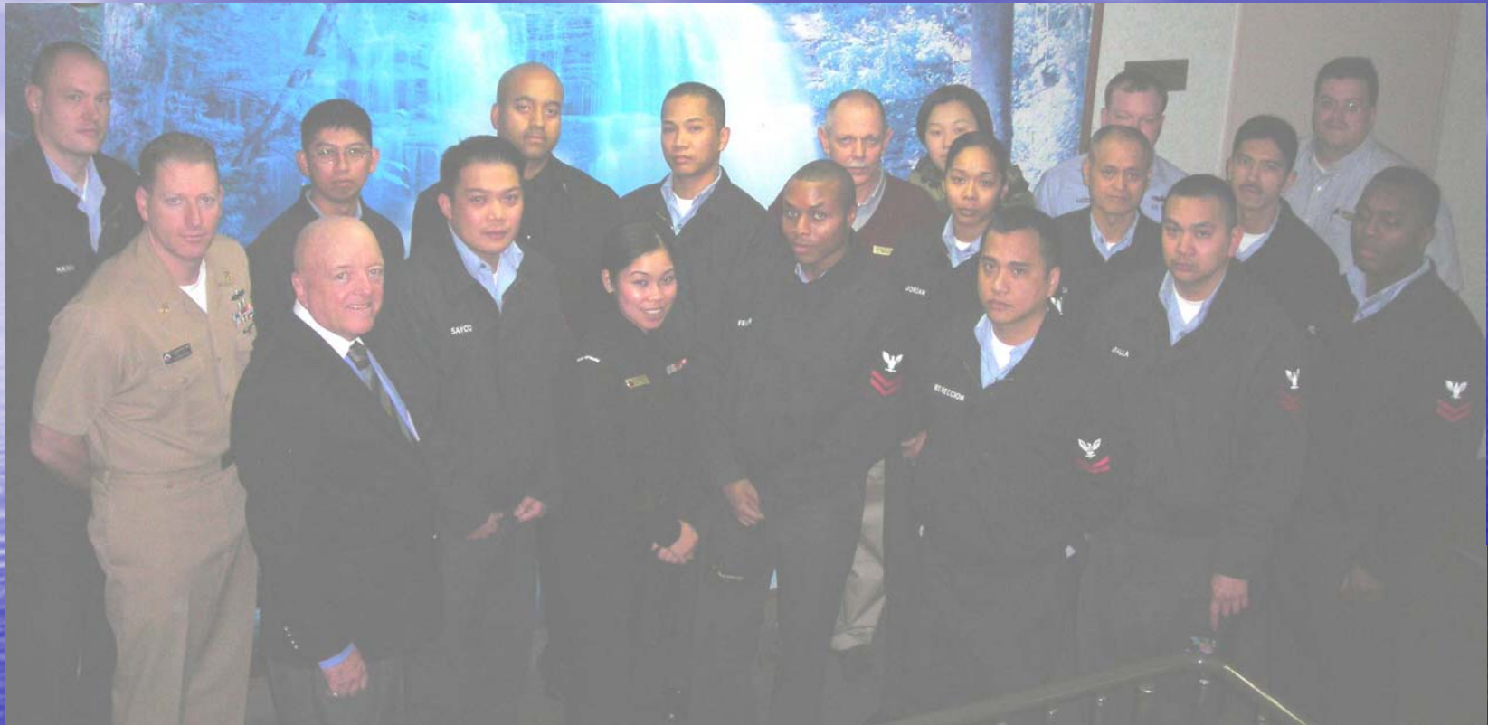
Naval Station, Atsugi, Japan January 2008