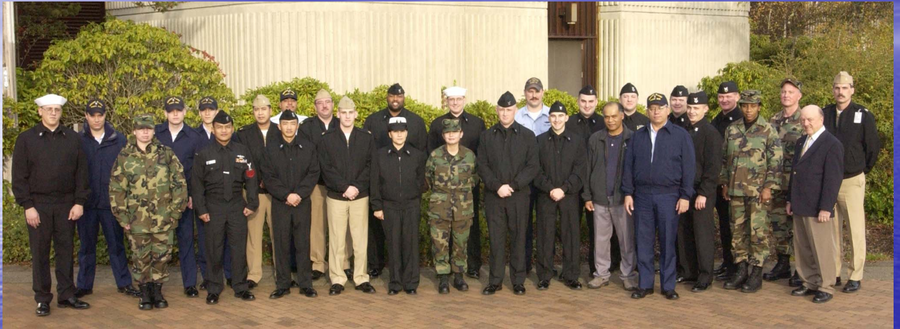
Trident Submarine Base, Bangor, Washington December 2005