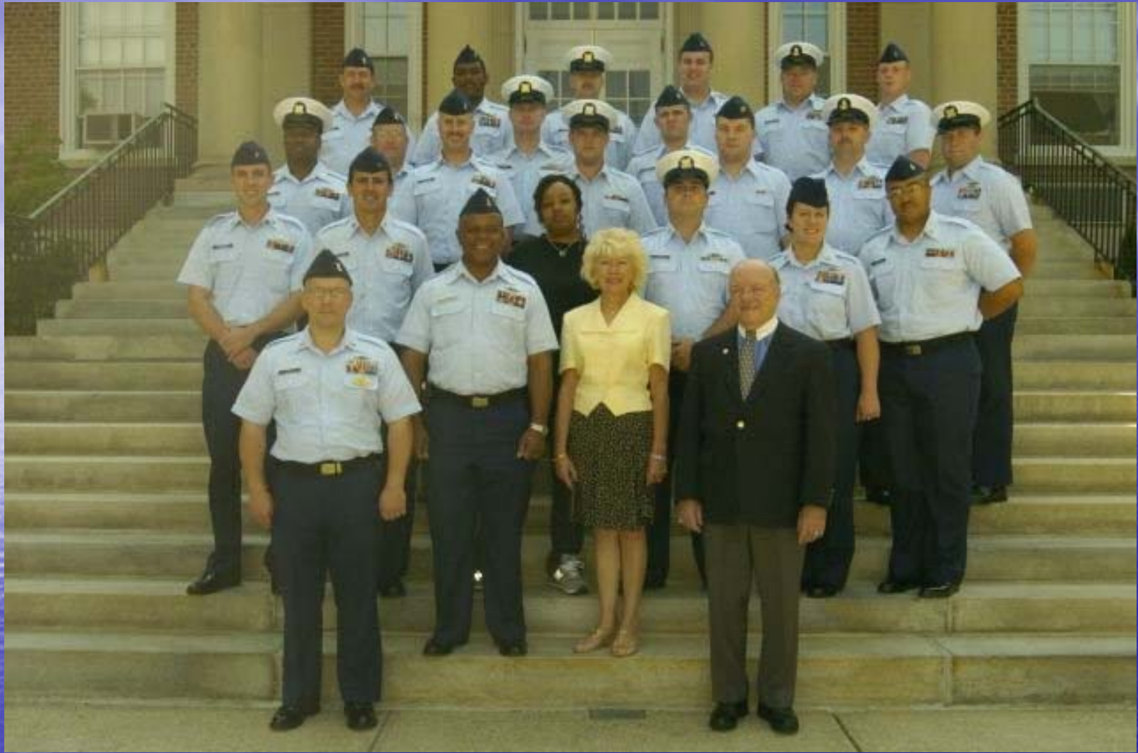
The Coast Guard Academy June 2005