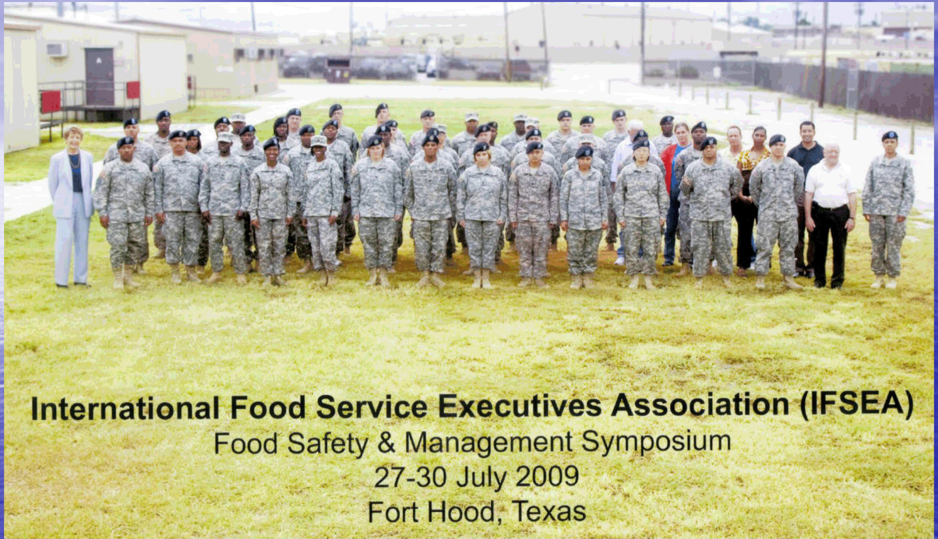
International Food Service Executives Association (IFSEA) Food Safety & Management Symposium 27-30 July 2009 Fort Hood, Texas