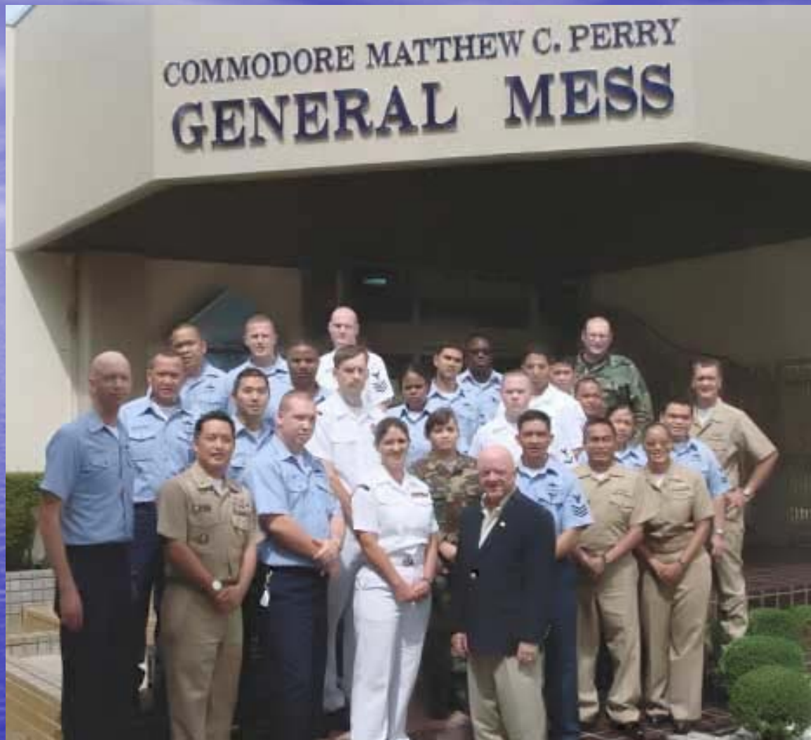
Yokosuka, Japan September 2007