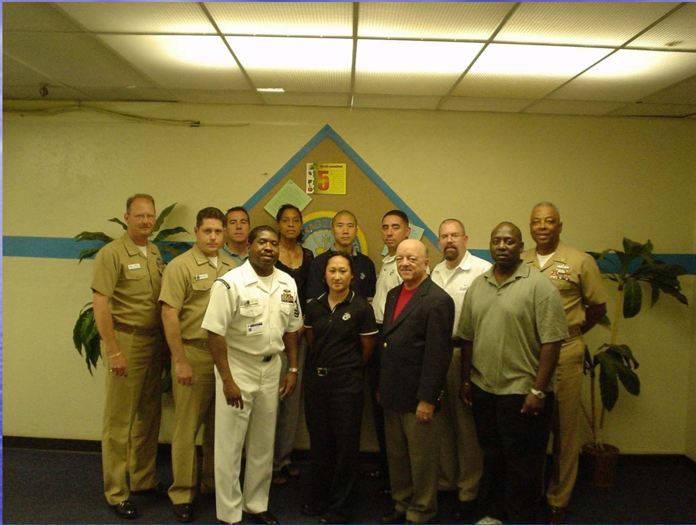
Naval Station San Diego July 2005