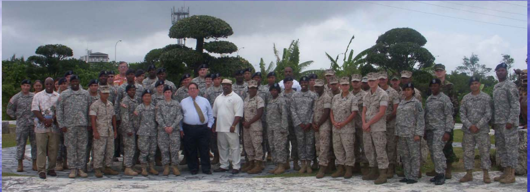
U. S. Army and Marine Corps, Okinawa, Japan September 2009