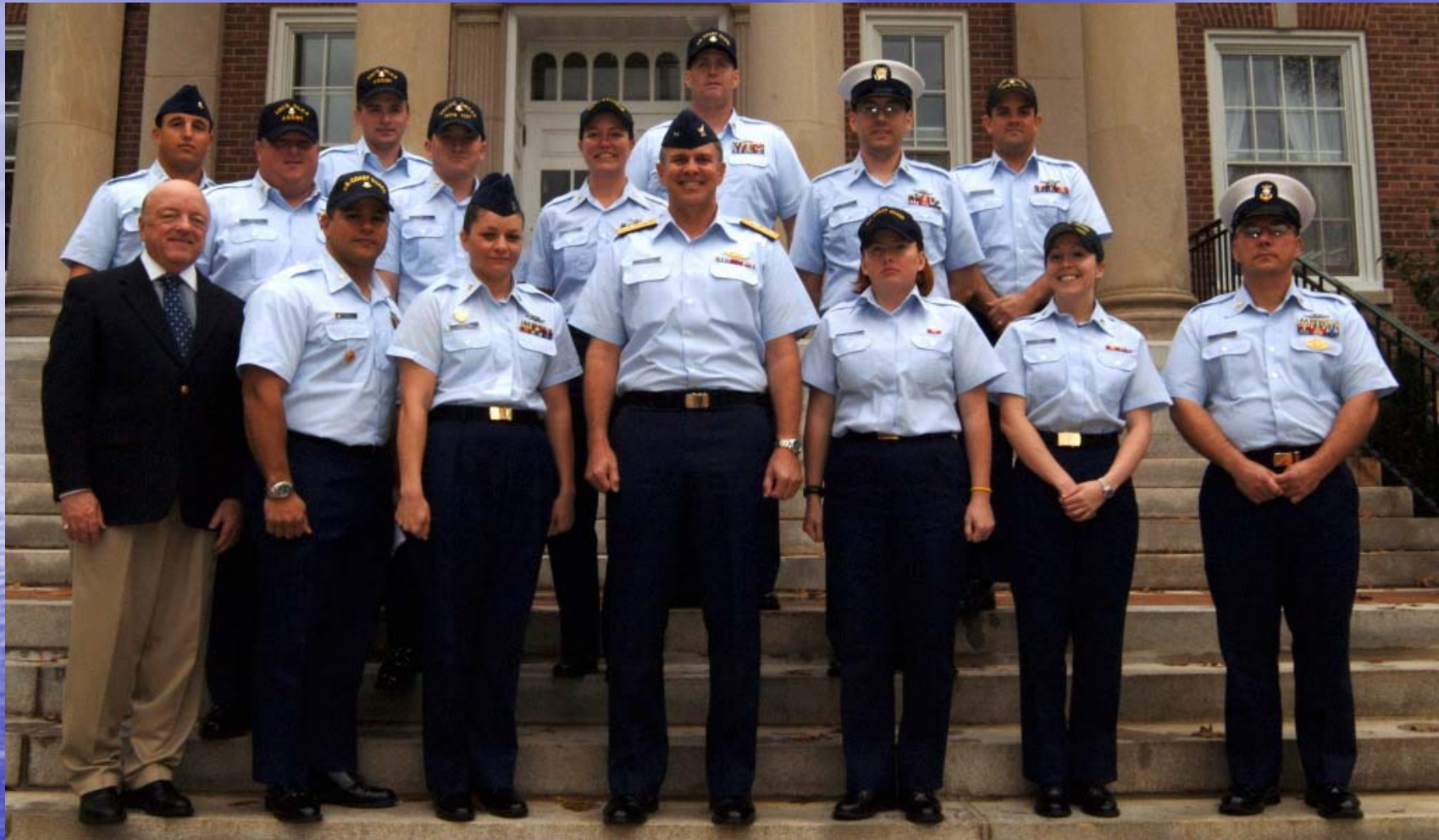
The Coast Guard Academy November 2005