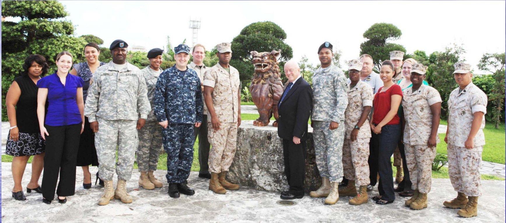
U. S. Army, Navy, Marine Corps, Marine Corps Clubs, Okinawa, Japan September 2010