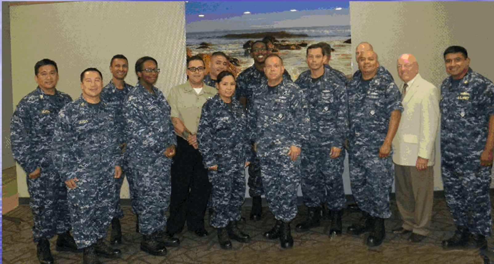
Naval Station, San Diego September 2013