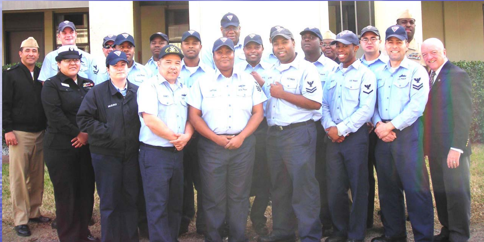
Naval Air Station, JRB, Fort Worth, Texas February 2008