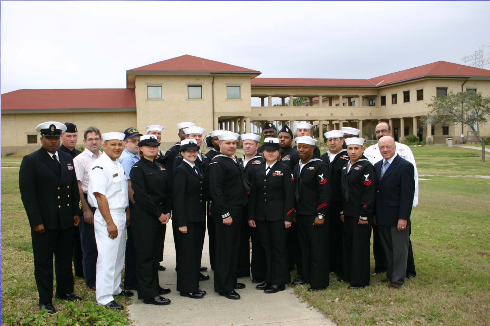
Navy Minesweeper Base, Ingleside, TX March 2006