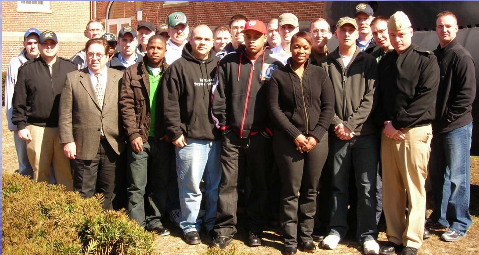
Submarine Base, Groton, CT March 2008