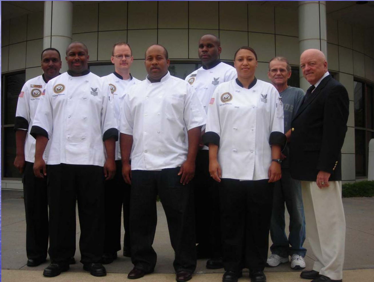
Great Lakes, Culinary Specialist "A" School August, 2007