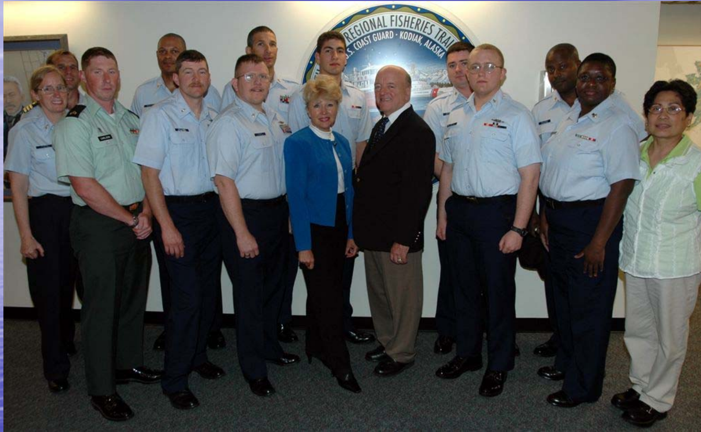
Coast Guard Station, Kodiak, Alaska July 2006