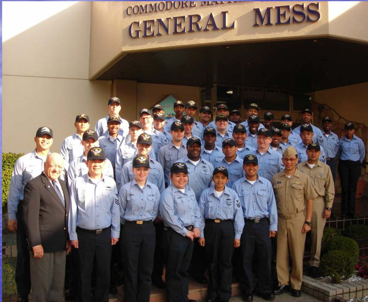
Yokosuka, Japan January 2009 – Week 2