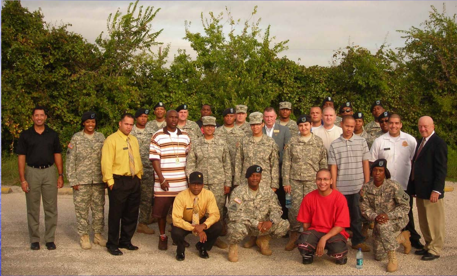
Fort Hood, Texas September 2009