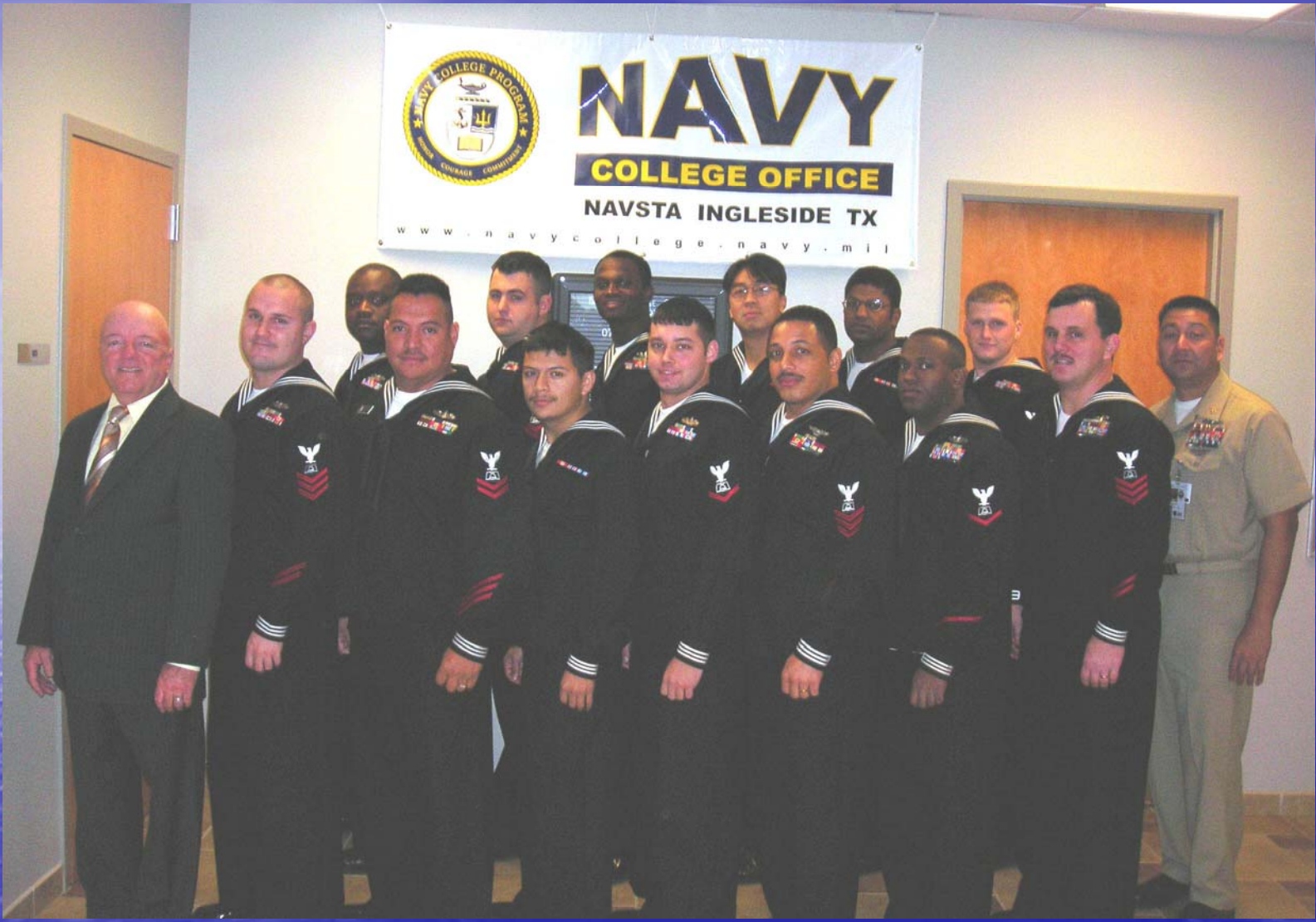
Navy Minesweeper Base, Ingleside, TX January 2007