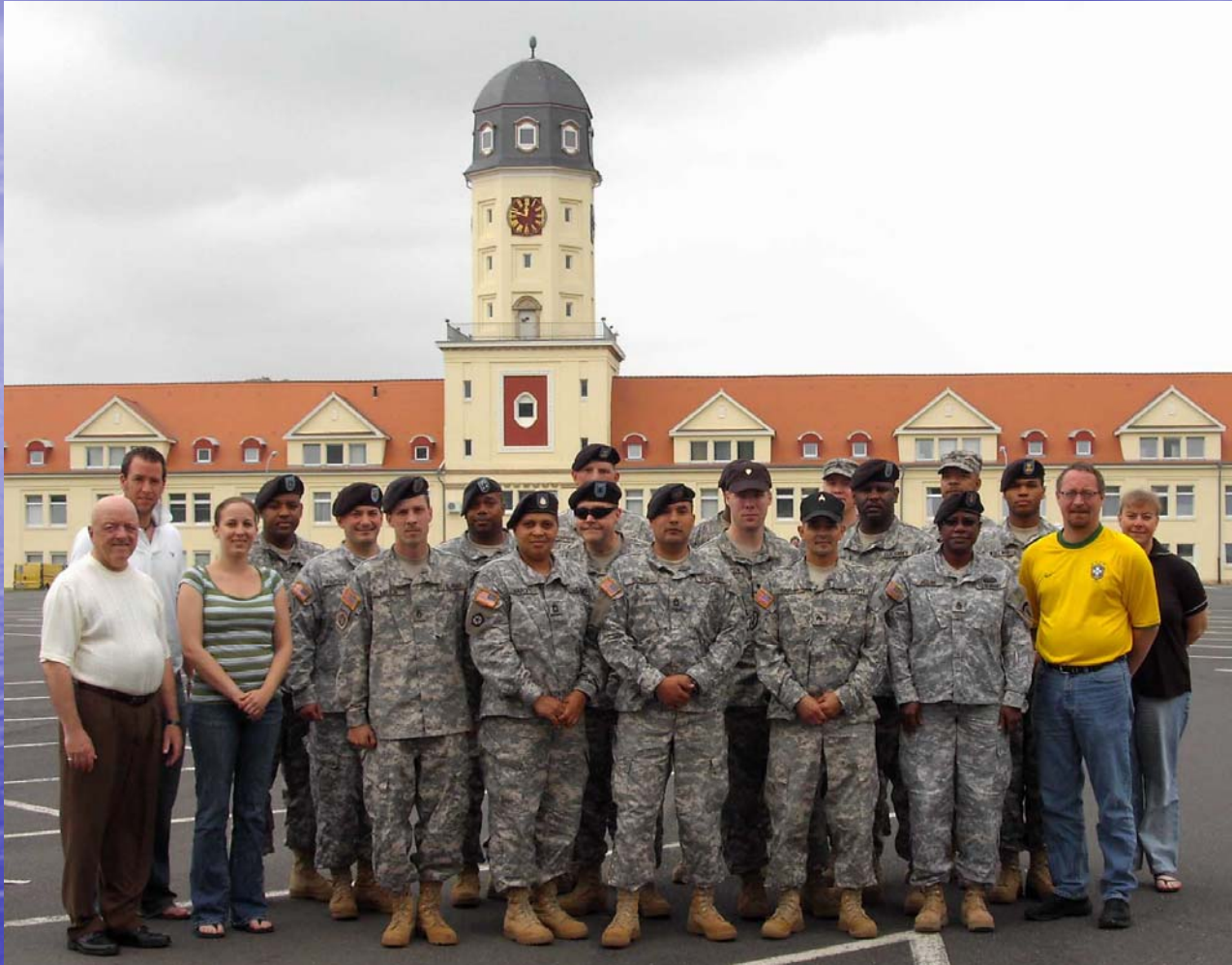
Kaiserslautern, Germany June 2008