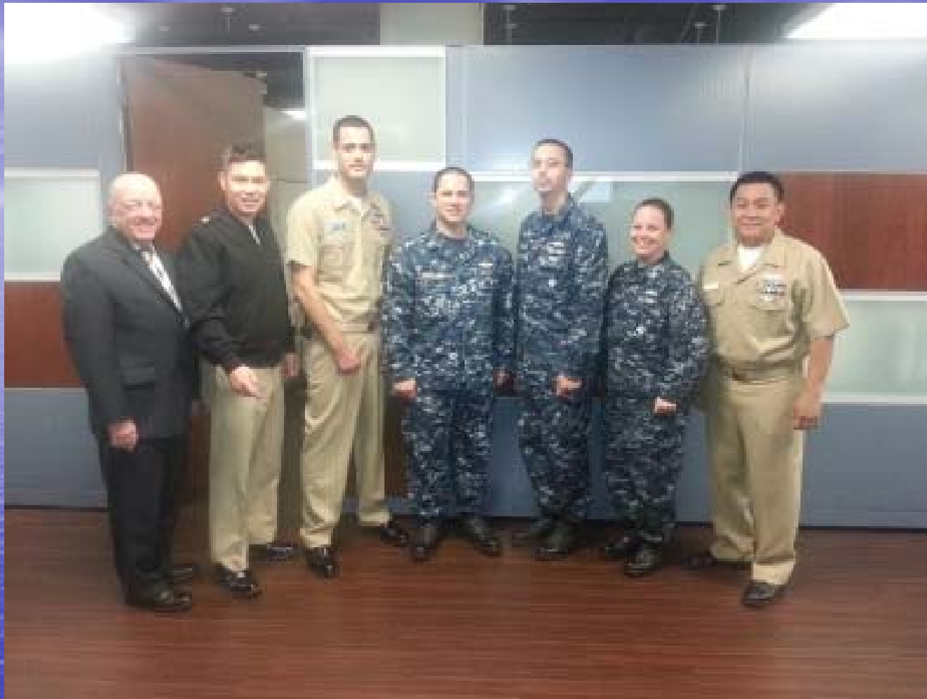
Naval Station, San Diego November 2013