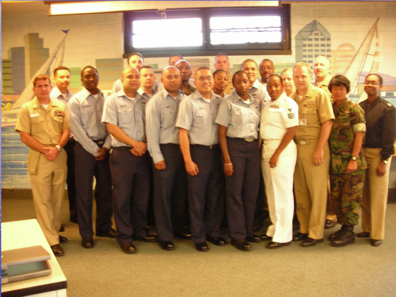
NAB Coronado, San Diego June 2008