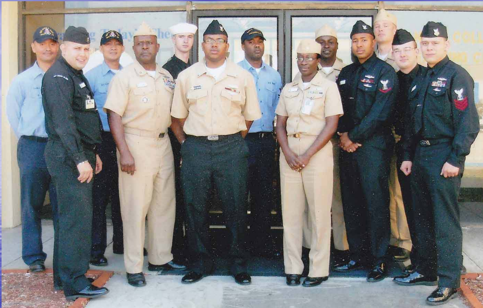
Mayport, Florida March 2009