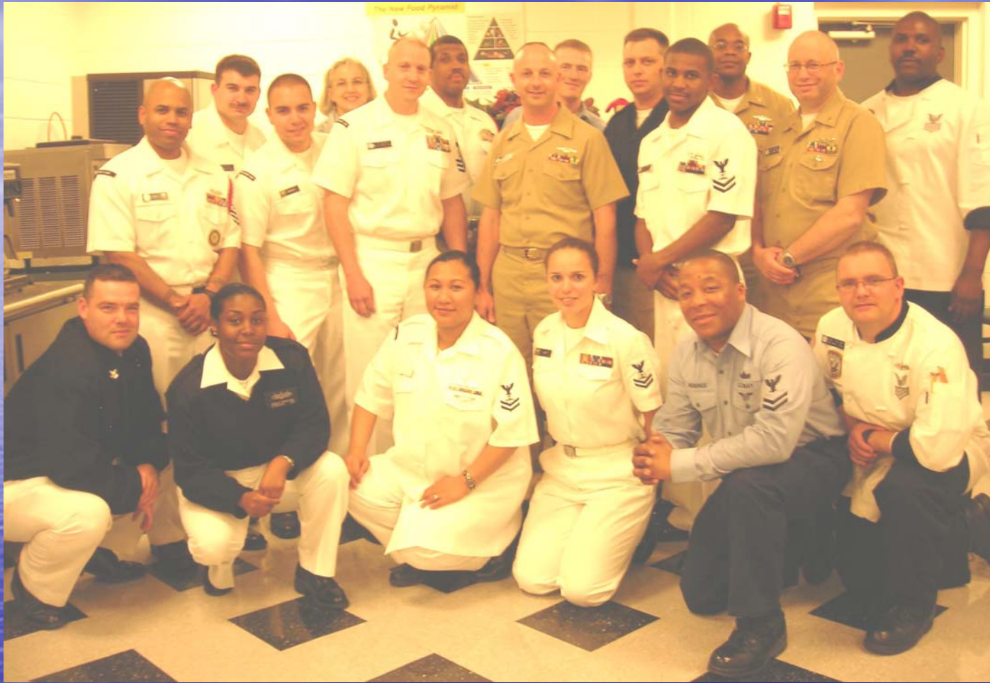
Great Lakes, Culinary Specialist "A" School May 2008