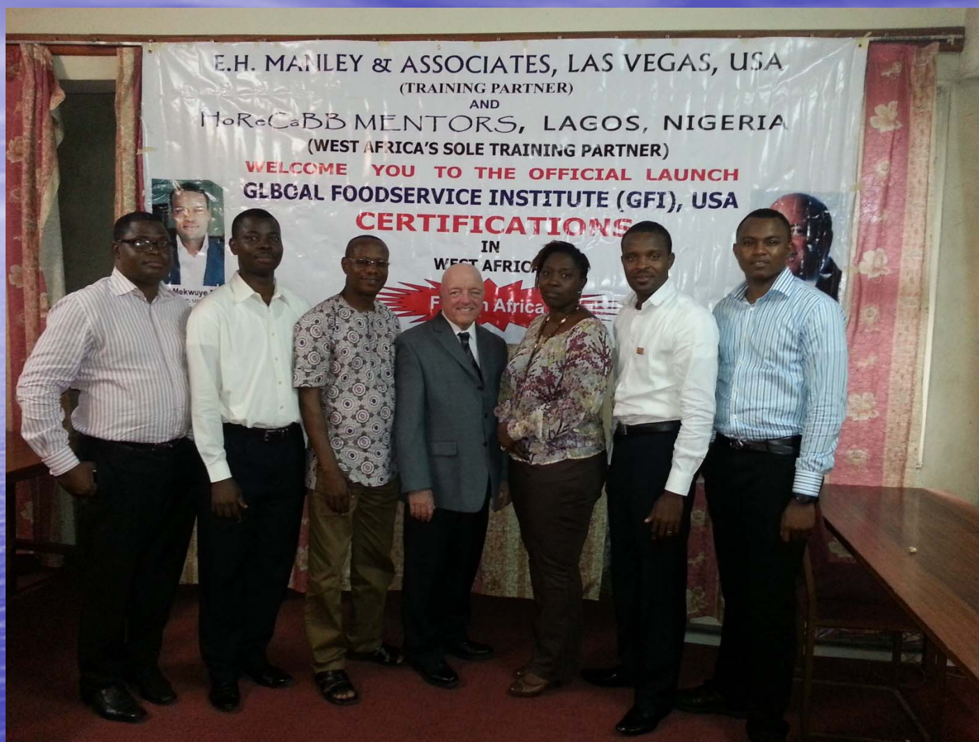
Lagos, Nigeria, West Africa November 2013