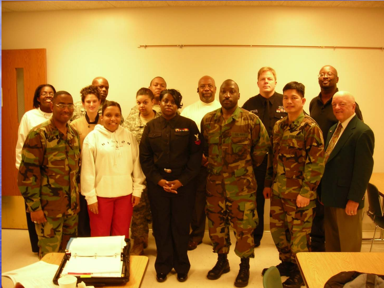
Fort Belvoir March 2008