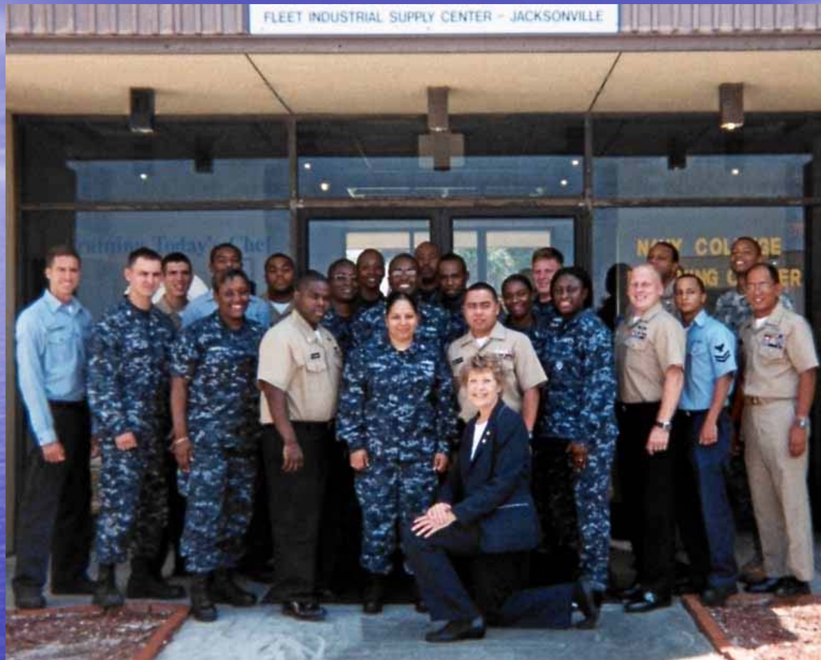
Mayport, Florida September 2009