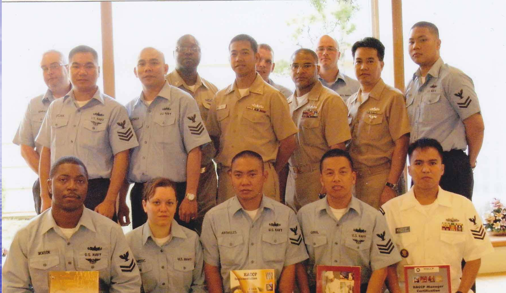
Yokosuka, Japan September 2008