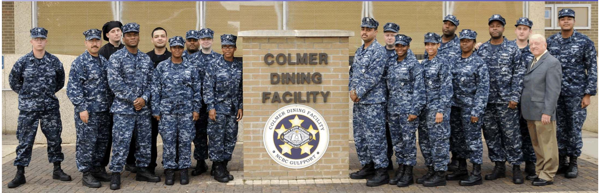
Naval Construction Battalion, Gulfport, MS December 2012